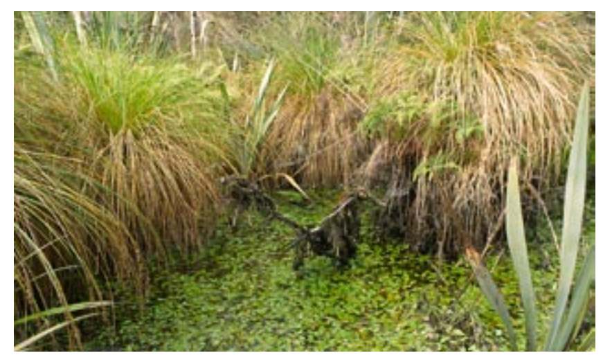
Fig. 27 A swamp pool in south Westland beneath trees and Carex secta tussocks, and covered with floating leaves of Potamogeton suboblongus : an example of how one wetland class (shallow water) can occur within another (swamp).