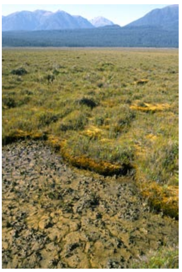
Fig. 30 A domed (or raised) bog is one having a convex surface, resulting from greatest peat growth in the most poorly drained central part. Lake Kini Pakihi in Westland is an example, though its dome, typically, is difficult to discern by eye.

One of the classic forms created by natural wetland processes is the domed bog (Figs 30 and 135), where peat has grown deepest in the most poorly drained centre, resulting in a convex surface that rises above the local topography and becomes progressively more isolated from inputs of nutrients from either the underlying mineral substrate or the surrounding