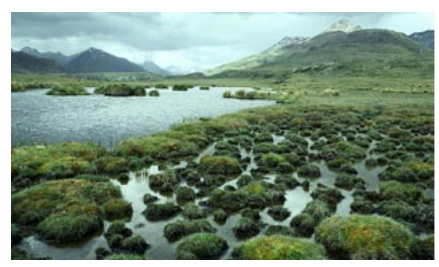
Fig. 25 Many wetlands create a hummock-and-hollow surface, because plant growth and peat accumulation are favoured on any ground elevated above the water table. This bog in the Mararoa Valley, northern Southland, has developed cushion forms. On a larger scale, note the islands formed by the elevated trunks of Carex secta within the pool.