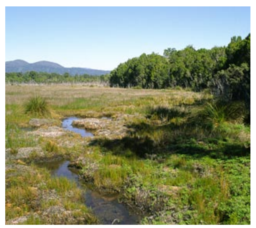
Fig. 31 A lagg stream: one which drains the perimeter of an extensive domed bog (see Fig. 30), Lake Kini Pakihi, Westland.

The convex nature of a domed bog is not always obvious to the eye, and may be confirmed only by accurate survey of the ground profile. The margins of a domed bog, more sloping, are where outward seepage can sometimes be discerned; these marginal slopes are referred to as the rand, and they typically drain down to a peripheral stream or swamp called a lagg (Fig. 31).