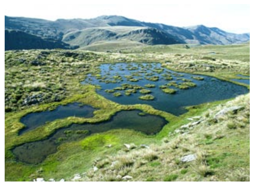
Fig. 29 A string mire is a superb example of a form created by wetland processes. The 'strings' are the elongated ridges of peat that act as dams on slight slopes, creating a sequence of pools in terrace fashion. Peat growth is most active where the bog mosses and sedges are constantly moist yet not inundated, so that the surface level of both the pool rims and the small pedestal islands continue to elevate, Garvie Mountains, northern Southland.

On a sloping peatland, depressions that are temporarily ponded (called flarks; Fig. 28) develop into permanent pools as peat growth adds to the relative height of their impounding rims (or strings), to produce a large-scale pattern of numerous pools, their long axes aligned across the slope: a string mire (Fig. 29), which is an excellent example of a patterned wetland. Little attempt has yet been made to classify New Zealand wetlands in terms of their patterning of surface form, relief, and arrangement of water features.