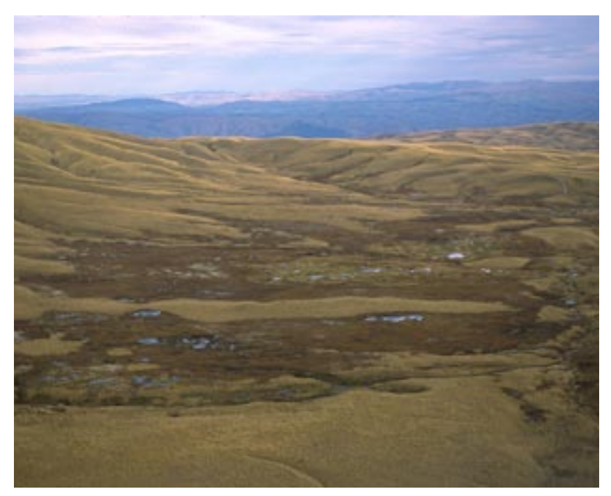
Fig. 24 Teviot Swamp occupies an upland basin on the Lammerlaw Range, Otago. Best classified as fen, the main peatland has developed upon a poorly drained fan that slopes gently to the right. The fen grades to seepages where water flow is more pronounced, both on the downslope margins and in the gullies upslope. The whole system is nourished by water that percolates from the deep soils of the adjacent tussock-grassland hills: a reminder that many wetlands are a surface expression of a whole catchment of groundwater.

river deposits and the relative ages of their wetlands can be gauged from aerial photos.