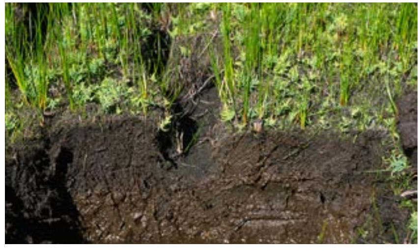
Fig. 26 Surface channels are common in peatlands, though often hidden by vegetation. In this Westland fen, fire has removed the former cover of plants and litter (these resprouting ferns and sedges are just 3 months old). A channel 10 cm deep is illustrated by the cutaway section of peat, revealing also that the water table, after a period without rain, lies somewhat below the channel base.