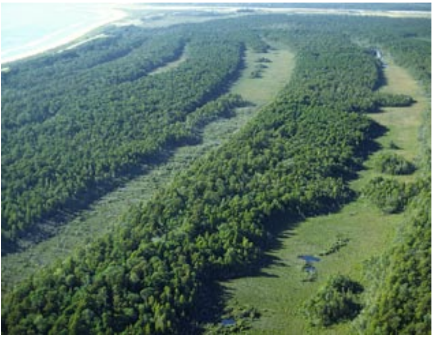
Fig. 23 On a coastal plain near Haast, south Westland, wetlands occupy the elongated hollows, or swales, between old beach ridges, now forested, and formed in sequence as the land has risen relative to sea level and as the coast has built seaward. The youngest ridges and wetlands are those closest to the coast. These peaty wetlands receive some water flow and nutrients from the adjacent land and are therefore mainly fens, though the least fertile parts are bogs, including forest bog on the small 'islands' of slightly higher ground within the swales.

Many palustrine wetlands occur upon landforms that owe their origin to riverine systems yet are no longer actively affected by river or stream processes. Poorly drained parts of old river systems become marshes, swamps, and bogs. Many marshes occur along the inner margin of river terraces, where they are fed by seepages or springs from the foot of the scarp which lies below the next highest terrace. When in flood, sedimentcarrying rivers tend to deposit some of their sandy and silty material close to the river margins, gradually building an elevated ridge, or levee; and whereas levees themselves are relatively well drained, the lower-lying land behind becomes progressively less so. A wetland that develops on a river terrace behind a levee is termed a backswamp. The development stages of