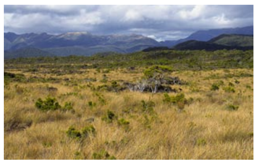
Fig. 32 Blanket peatland can cover large extents of gently sloping land, irrespective of topography, in districts with a cool, windy climate. Here on the West Cape table-lands in Fiordland, tussock bog covers the most poorly drained peat, and grades to shrub bog and tree bog where drainage and fertility are marginally better.

When several wetland classes or even more than one hydrosystem occur together, as indeed happens regularly, they form what is termed a wetland complex.