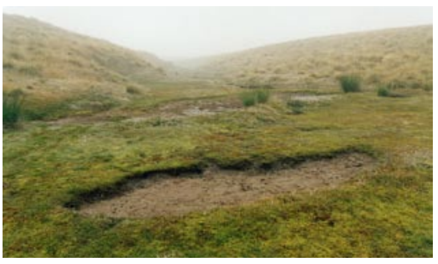
Fig. 28 Two flarks in an upland gully seepage, Lammermoor Range, Otago. Flarks are temporary ponds in peatland and they can become deeper, permanent pools as peat growth continues only on the vegetated margins.