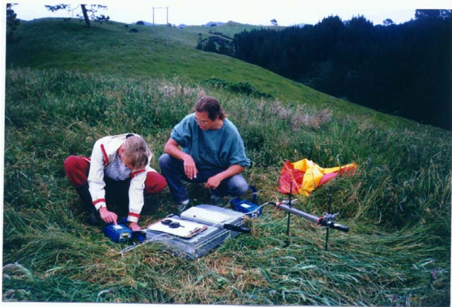
Plate 2 Taking readings with the LAI-2000 canopy analyser at stream level (B). A small plastic bottle was taped on the sensor 'wand' to avoid submersion.

Plate 1 Calibrating the LAI-2000 sensors at the reference site on a hilltop near the stream reach to be surveyed. The reference (A) sensor is fixed in position with laboratory clamps fitted to steel pins driven into the ground.