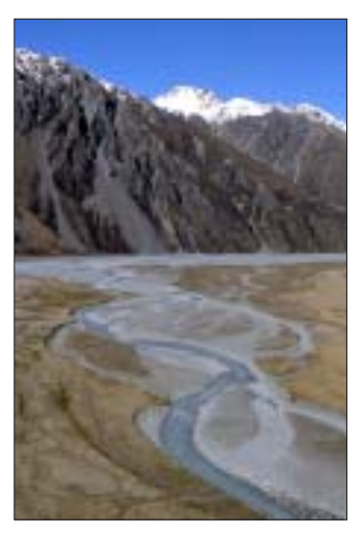
The Hooker River, Tasman Valley.

Mortality of stoats was higher in autumn 2002 than in previous seasons and trapping indices were much lower than usual in spring 2002, suggesting that stoat numbers in the study area were declining. The reasons for this decline are not clear, but may signal natural long-term changes in stoat density in this habitat. Further investigation is needed to inform effective and proactive conservation management for this area. In the Mackenzie Basin, stoats appear to be common only in the Tasman and Godley River valleys, which are both high-altitude rivers close to the main divide. Stoats have the ability to disperse over large distances and it is possible that the forests west of the main divide provide a reservoir of stoats for repopulating the upper braided rivers of the Mackenzie Basin.