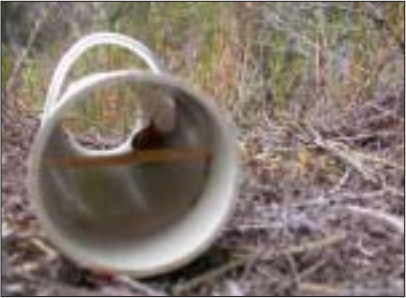
A hair tube set to 'capture' hair from stoats passing through.

or within areas of high conservation value. Attempts to mitigate the predation impacts of stoats by kill-trapping in areas of high conservation value may be compromised either by high reinvasion rates, or the survival of too many resident stoats, or both. Despite stoat control (Fenn Traps over a 10 000 ha core area), high predation rates on juvenile kiwi were observed in Okarito Forest, South Westland, throughout the summer of 2002/03.