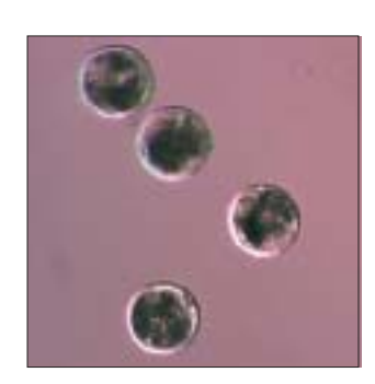
The first blastocyst produced in vitro from two cells.

This project will now be completed by June 2004.