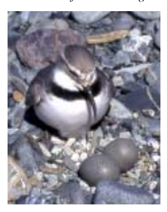
A wrybill at its nest, Tasman River.

Live-capture and radio-tracking of stoats in and around the Tasman River was undertaken to gain information on stoat home range size, activity patterns, and habitat preferences. The home ranges of male stoats were found to be significantly larger than those of females, with wide variation in home range size recorded. One male had a very large range in spring (estimated at 810 ha and 7.1 km in length). Home ranges of stoats were found to overlap, with more stoats overlapping in spring than in autumn.