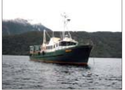
The m.v. Renown in Fiordland waters.

All the islands included in this study are within stoat swimming distance but are unlikely to support resident stoat populations.