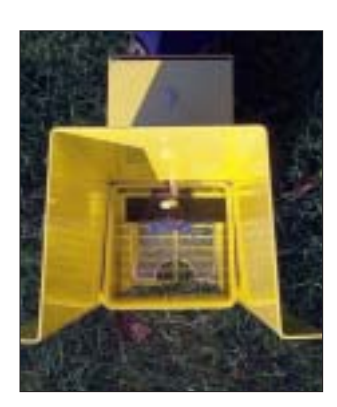
An animal's view of a Hammer trap.

Additional information on this trap can be obtained from NZTRAP@Yahoo.co.nz