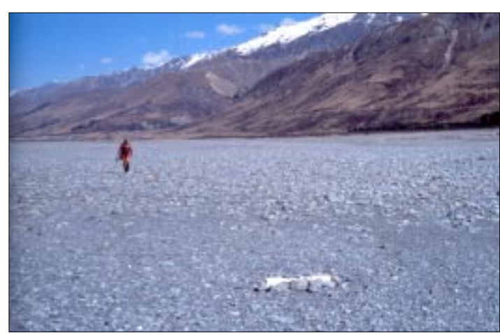
A tracking tunnel line on the gravel bed of the Tasman River.

Live-capture and radio-tracking of stoats in and around the Tasman River is being undertaken to gain information on stoat home range size, activity patterns and habitat preferences. Radio-tracking is being done during a 3-month period in spring-early summer (when the shorebirds are breeding) and again in autumnearly winter (when the shorebirds are absent). Some problems have been experienced with transmitter life in the bouldery environment of the riverbed; however, good data has been collected as animals were easily re-trapped, where necessary.