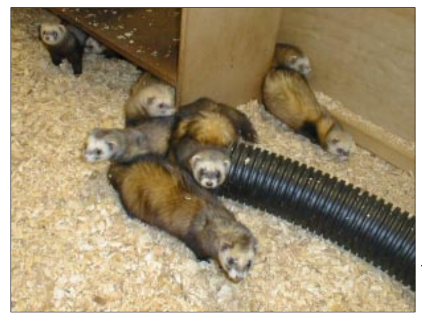
Ferrets in free-range pen at facility.

Research to be initiated in 2001/2002 will include: