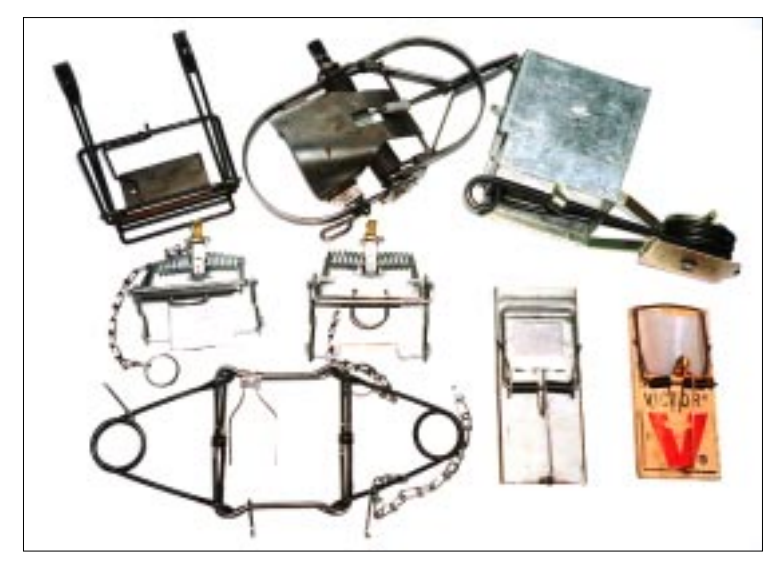
Various traps used to kill stoats.

base that was prone to rot and the plastic trigger plate that was often removed or chewed by rats. The prototype has a steel base to increase robustness and field life, heavier springs to increase the likelihood of a humane kill and a cubby to guide the head into the trap to increase the likelihood of a neck strike. Performance tests have shown that the prototype has four times the striking force and two times the clamping force of the modified Victor Professional rat trap. This prototype also has a similar striking force, but only one-fifth of the clamping force of the Fenn trap.