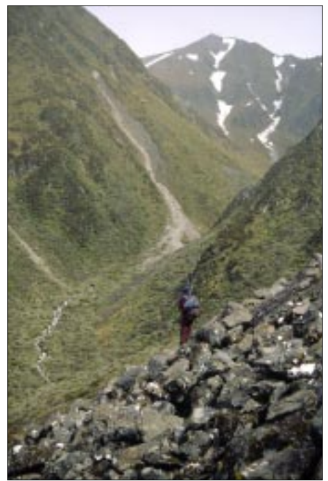
Alpine study site in Ettrick Burn, Murchison Mountains.

Almost all of the ecological research on stoats in New Zealand has been confined to lowland forest habitat, with little or no study of alpine regions. DOC is investigating the feasibility of a stoat control programme in Fiordland to protect breeding takahe and other avian species that live above the treeline in the alpine/tussock zone. The objective of this study was to determine whether trapping in adjacent, more accessible valley floors would impact on the alpine stoat population.