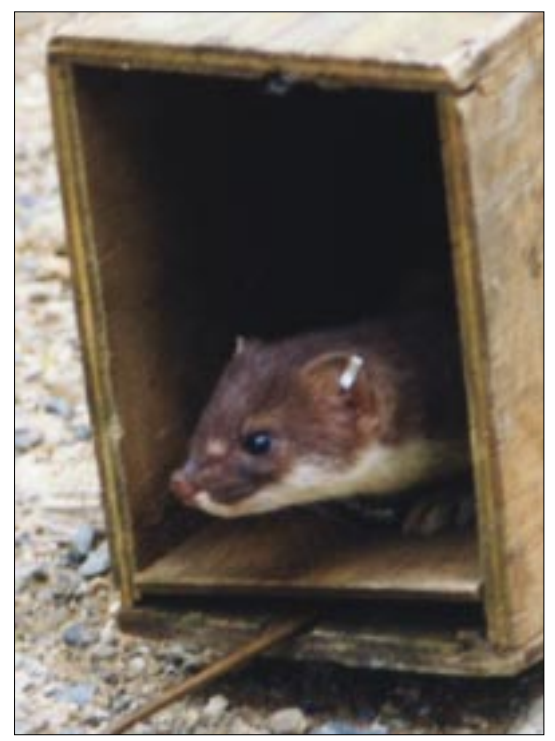
Ear-tagged stoat coming out of a live trap.

Electronic methods using either short-range detection (via radio transmitters) or Passive Integrated Transponder (PIT) tags would be the best tools for determining the optimum spacing of stations. However, while PIT tags are inexpensive, the capital investment needed for antennae to detect the tags and associated data-loggers would be high. A PIT reader ($500 each) would be needed at each tracking tunnel or bait station being monitored in the study. Data-loggers for the PITs or radio-tracking would cost over $2500 each. The wide spacing between control stations would mean that few stations could be monitored from the same data-logger. Thus the scale of stoat movements makes the use of electronic tools impractical for the proposed spacing study.