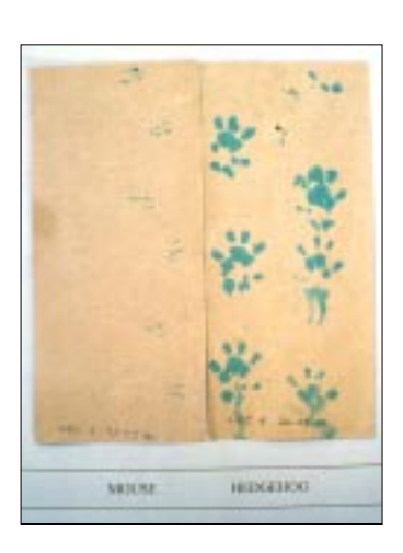
Tracking papers showing stoat and ferret prints ( left), and mouse and hedgehog prints ( right).