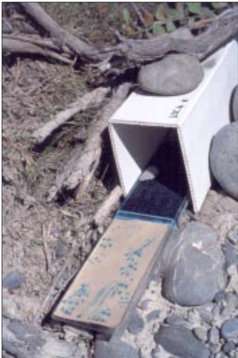
Tracking tunnel in the Tasman River.

Results to date show that stoats are generally evenly spread throughout the area with no obvious 'hot spots' and no large areas where they are absent. Range sizes appear to be consistent with the limits found in other studies in different habitat types in New Zealand. Rabbit numbers are not high in the study area and rodents appear to be scarce for much of the year (RHD was introduced to the study area 3 years earlier). Thus, it appears that relatively high densities of stoats can persist in spite of the lowered rabbit densities. Stoats appear to survive in this environment by eating birds and the few rabbits available. Remains of eggs, chicks, or adults of pied oystercatcher, banded dotterel, spur-winged plover, wrybill, and black-fronted tern have all been found in dens, indicating that stoats in this area are having a major impact on breeding shorebirds.