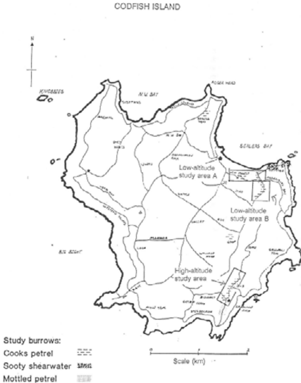
Figure 1: Petrel and shearwater study areas and track network.

Stead, E.F. 1935. Codfish Island, an unspoilt resort for the naturalist. The Press , Christchurch. 19 January 1935, p.17.