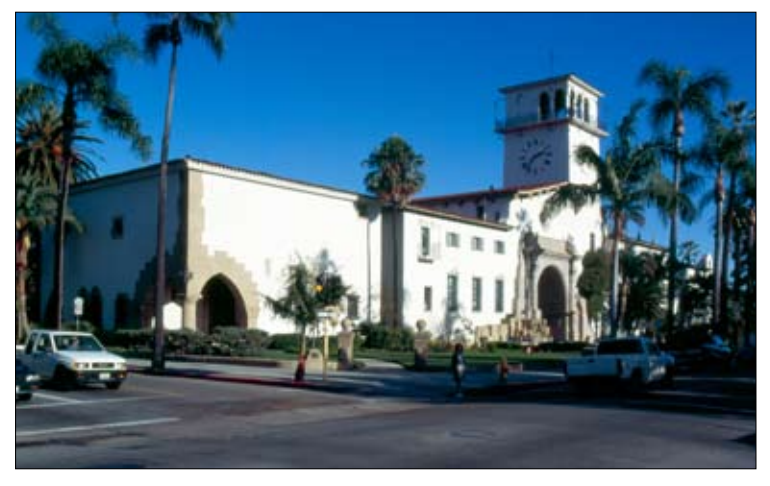
Figure 23. Santa Barbara County Courthouse, Santa Barbara, CA, built 1925-29.

Santa Barbara's architectural character is usually defined as Spanish Colonial Revival or Mediterranean. This stems from the presence in the city of buildings dating from the Spanish colonial presence in California, in particular the Santa Barbara Mission, founded in 1786. The revival of this style was a means of expressing local identity, as it makes a direct connection with the city's early history. By emphasising a sense of continuity with the earliest buildings constructed in the area by Europeans, the new buildings in the Spanish Colonial Revival style were perceived as belonging to an authentic Californian architectural idiom.