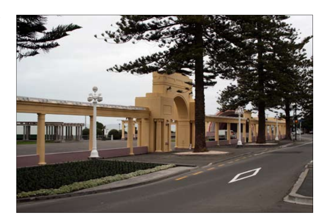
Figure 26. New Napier Arch and Colonnade, Marine Parade.

The human significance of Napier is summed up by the phrase written on the New Napier Arch on Marine Parade, built following the earthquake to the design of the Napier Borough Council Architect, J.T. Watson. The attic storey of this triumphal arch bears the inscription, 'Courage is the thing: all goes if courage goes' (Fig. 26). This phrase sustained the city's citizens during Napier's darkest hours. Paradoxically, in a city that was celebrating its newness, the designer of the arch turned to the timeless language of classicism, although in a simplified and abstracted form. The arch itself celebrates triumph over adversity as well as the enduring nature of human courage and perseverance. Over and above its architectural, aesthetic and urban values, the rebuilding of Napier is an enduring expression of these fundamental human values.