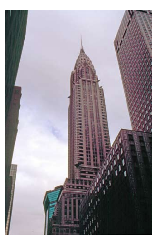
Figure 24. Chrysler Building, New York City, NY, built 1930.