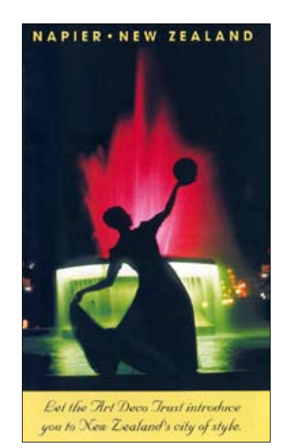
Figure 16. Tourist brochure, Art Deco City, Napier, New Zealand.

and 2004 (Bilman & Gill 2004), documented the extent of the city's Art Deco heritage. By 1999, when Napier hosted the Fifth World Congress on Art Deco, the city had become a destination for both national and international cultural tourism based around its Art Deco architecture (Fig. 15). The national profile of Napier's Art Deco has been further enhanced by the impressive series of local and national awards that the Art Deco Trust has received, beginning with its winning of the Cultural Heritage Section of the New Zealand Tourism Awards in 1993, and culminating with success as winner of the Best Large Event for the Fifth World Congress on Art Deco in the New Zealand Events and Management Conference Events Awards in 1999, and as New Zealand winner of the British Airways Tourism for Tomorrow Awards in 2000 (Fig. 16).