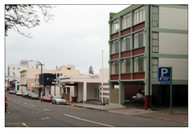
Figure 17. View of Tennyson Street with the Tennyson Motor Inn on the right, showing the intrusive impact of multi-storey buildings on the townscape.