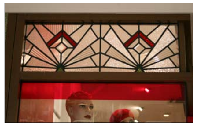
Figure 20. Detail of reconstructed Art Deco shop window on Emerson Street.