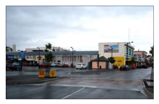
Figure 21. Parking areas on the north side of Dickens Street.