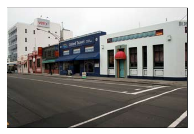
Figure 18. Vero Building on Tennyson with adjacent single-storey buildings dating from 1931 to 1932 on the right.