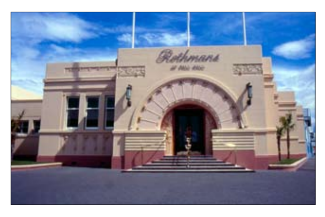
Figure 22. Former Imperial Tobacco Company Building, Ahuriri, built 1933.

For all the coherence of the Art Deco precinct, the integrity of the area is also compromised by the number of significant buildings that have been isolated on its periphery and thereby excluded. This is particularly problematic on Dickens Street, which remains built up and includes a number of important 1930s buildings on its south side, but has been severely eroded in a wasteland of car parks on the north side of the street. Thus, what should be a transitional, buffer zone to the Art Deco precinct is, instead, an unappealing backyard (Fig. 21).