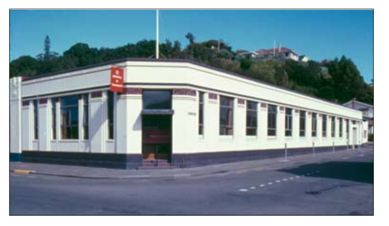
Figure 10. Ross & Glendinning Building, Tennyson Street and Cathedral Lane, built 1932.