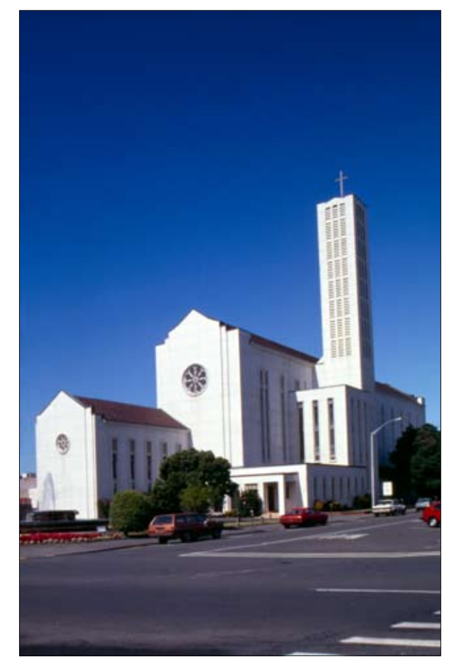
Figure 6. St John's Anglican Cathedral, Browning Street, built 1955-65.

the spiritual resilience of the population, replacing a temporary wooden church that had been constructed immediately after the earthquake destroyed New Zealand's only 19th-century masonry Anglican cathedral. Consideration should be given to the inclusion of St John's Cathedral within the proposed World Heritage site.