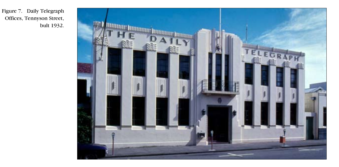
Figure 8. Masonic Hotel, Herschell Street, built 1932.