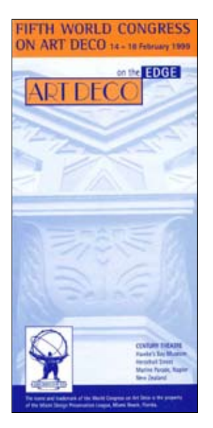
Figure 15. Flyer for Fifth World Congress on Art Deco: Art Deco on the Edge, Napier, 14-18 February, 1999.

role in raising public awareness of the city's distinctive architecture. The Napier City Council's Art Deco Inventory , prepared in 1991 and revised in 1995, 1997