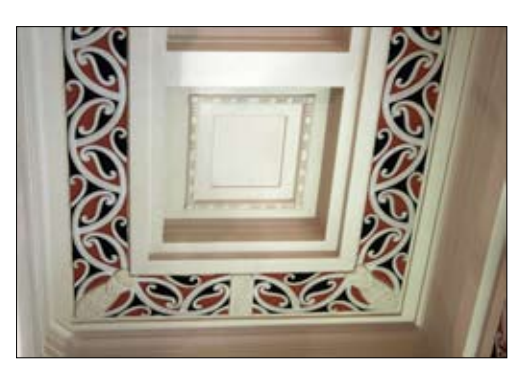
Figure 12. Former Bank of New Zealand Building, detail of ceiling.

While many of Napier's new buildings merely adopt the ready-made decorative features of Art Deco, especially the zigzag motif, others reveal the attempts of local architects to adapt the Art Deco preference for 'primitive' and exotic decoration to the local context, with both E.A. Williams in the Ross & Glendinning building (1932) (Fig. 10), and Crichton, McKay and Haughton in the former Bank of New Zealand building incorporating Māori kōwhaiwhai patterns into the decoration of their buildings (Figs 11 & 12). The presence in Napier