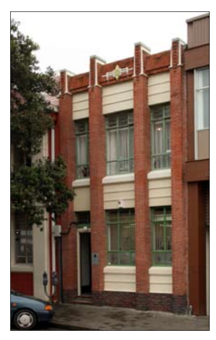
Figure 13. J.A. Louis Hay Office Building, Herschell Street, built 1932.

of J.A. Louis Hay, an architect of considerable individuality and distinction, also adds to the architectural interest of the city. Hay's admiration for the work of Frank Lloyd Wright and his Prairie School contemporaries was unique in provincial New Zealand at this time (although the American architect R.A. Lippincott, who was also familiar with Wright's work, was currently working in Auckland). Hay's most notable buildings include the former Fire Station (1926 and 1931), AMP Building (1935), Museum and Art Gallery (1936), and his own offices in Herschell Street (1932) (Fig. 13). These display an individual response to the decorative vocabulary of Chicago School architects such as Wright and Louis Sullivan that is unexpected in a place so remote from the architectural innovations of the early 20th century. Thus, while modest in its overall execution, Napier's post-earthquake architecture demonstrates considerable ambition in its aspirations.