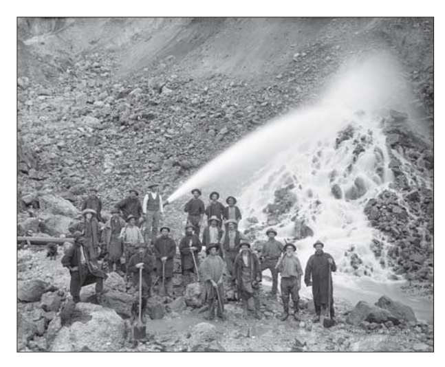
Parapara Sluicing Co. staff, 1890s. Photo by Tyre Brothers, Nelson. Reproduced by permission of the Alexander Turnbull Library, Wellington, N.Z. Ref. no. G-528-10x8.