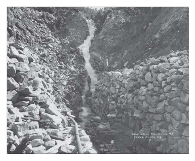
The Glengyle Dam, Collingwood. Photo by Tyre Brothers, Nelson. Reproduced by permission of the Alexander Turnbull Library, Wellington, N.Z. Ref. no. G-530-10x8.