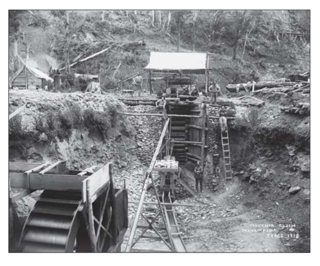
Quartz crushing plant at Hibernia Claim, Mahakipawa.