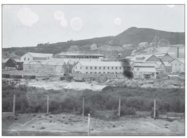
The Old Waihi-Martha Battery before shifting to Waikino.