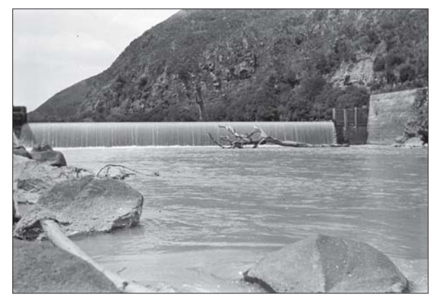
Weir in Karangahake Gorge that supplied water power to the Talisman Battery.