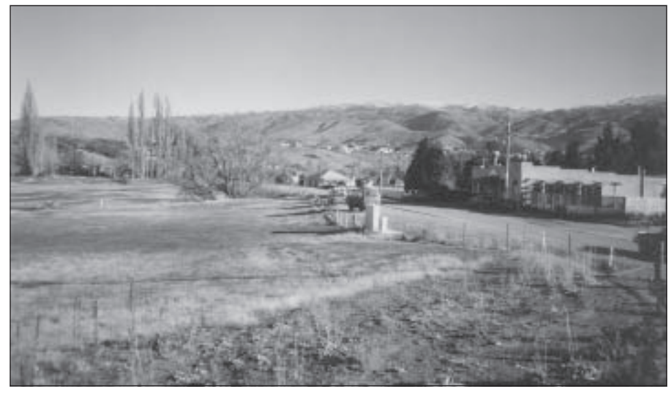
Figure 16. Coalpit, Bannockburn (no date).