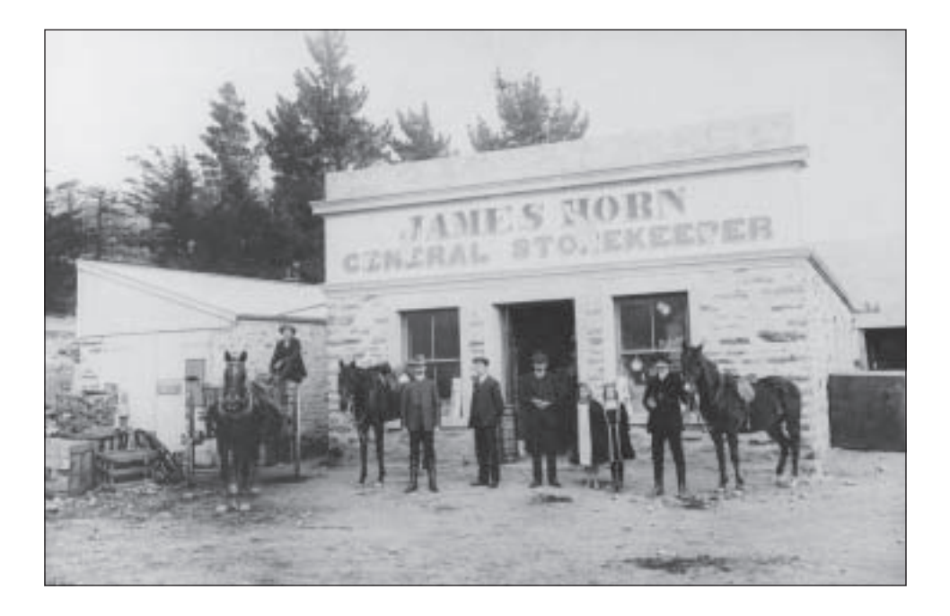
Figure 13. General store, Bannockburn, 1910.

earthworks. By 1869 the banks of the Kawarau River had been sluiced. In 1873, Baileys Gully (also known as Raupo Gully) at Bannockburn, an area that already been surface sluiced, was reworked, and the miners broke through a false bottom to relatively rich ore bearing layer (Parcell 1976: 35-37). The whole of Templars Hill had been sluiced away by April 1883 (Parcell 1976: 33).