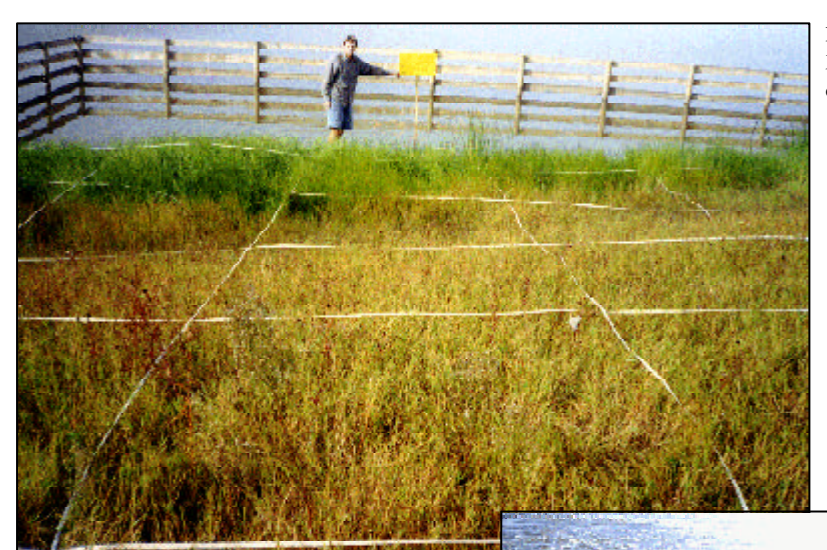
Plate 5. Exclosure Plot 2, view towards lake, March 2000. Note band of emergent vegetation dominated by Eleocharis acuta .