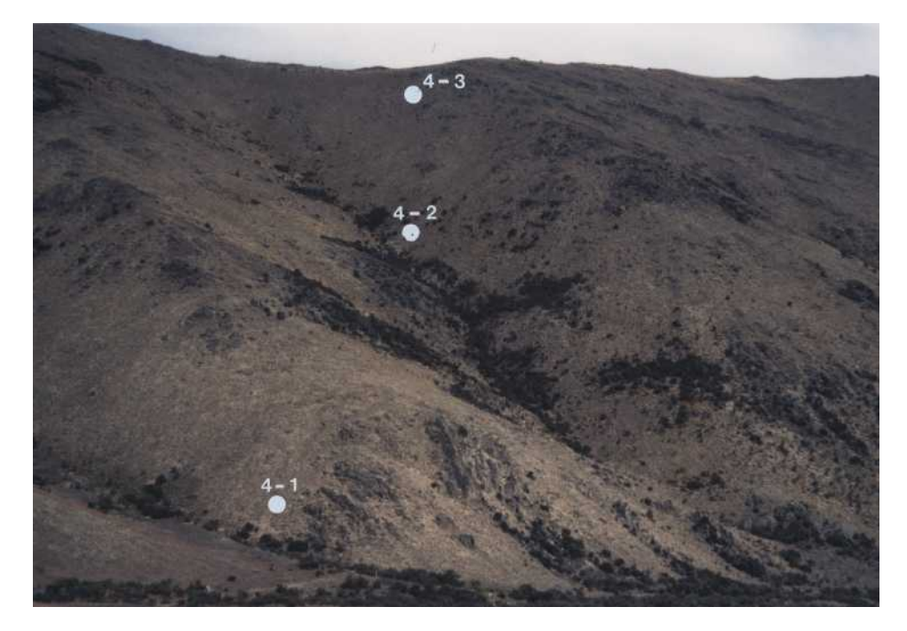
FIGURE 2. THE LOCATION OF SHORT TUSSOCK GRASSLAND PLOTS ON A WARM, SUNNY ASPECT HILL SLOPE IN THE CATCHMENT OF ROSS STREAM.