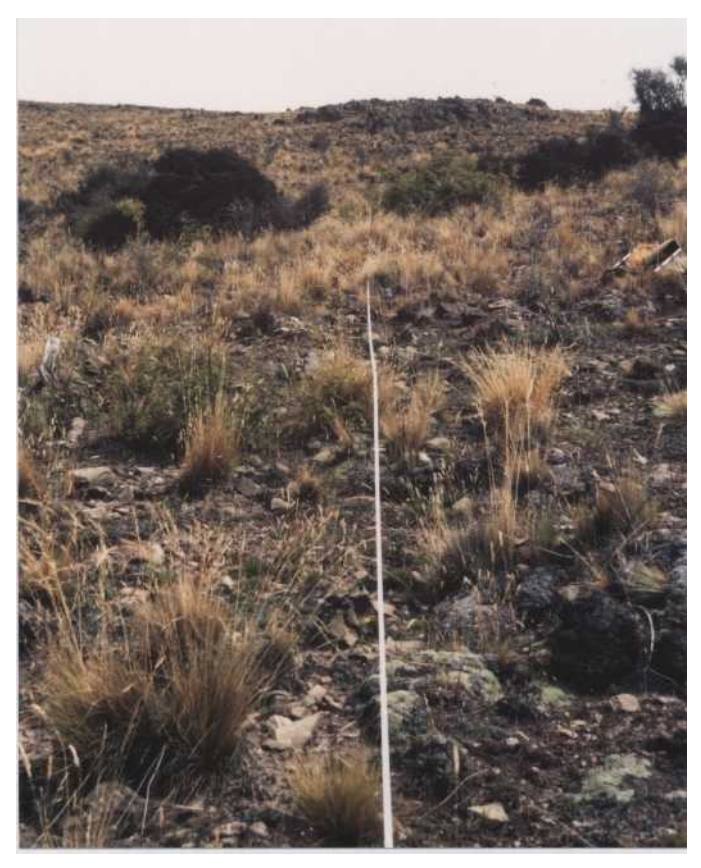
PLATE 2. SHORT TUSSOCK GRASSLAND, WITH PLOT 4/2, UPPER 1973, LOWER, 1993. TUSSOCK AND OTHER GRASSES HAVE DECLINED AND MOUSE-EAR HAWKWEED INCREASED. THE EXTENT OF BARE GROUND INCREASED SLIGHTLY.