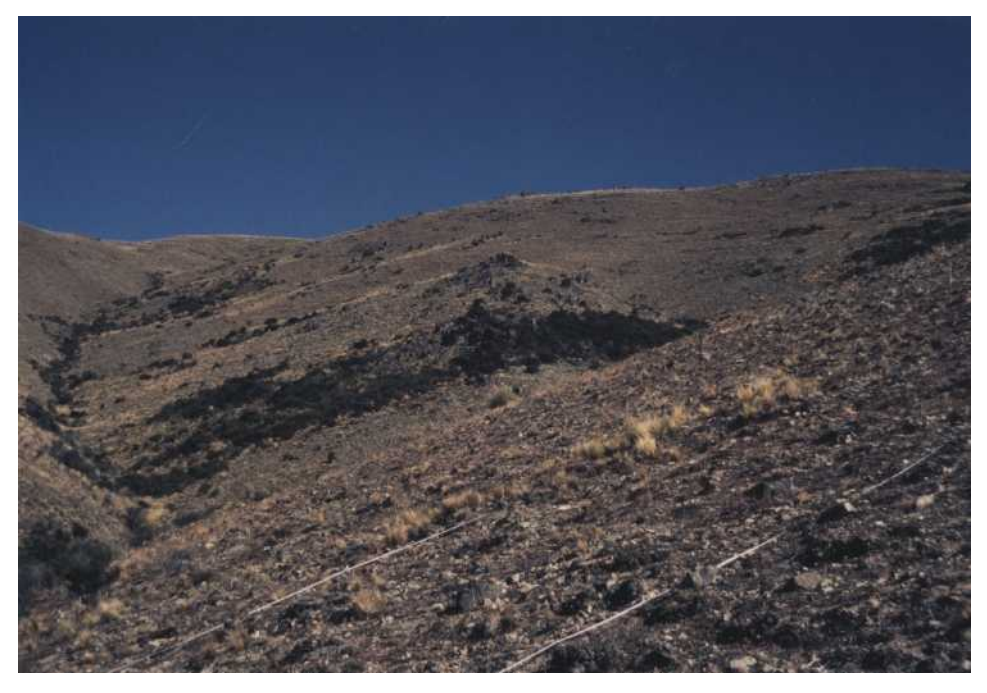
PLATE 1. SHORT TUSSOCK GRASSLAND, WITH PLOT 4/1 IN FOREGROUND; UPPER 1973, LOWER, 1993. VISUALLY DISTINCTIVE CHANGES INCLUDE A DECLINE IN SHORT TUSSOCK AND AN INCREASE IN MOUSE-EAR HAWKWEED. SCRUB HAS LOCALLY INCREASED IN THE MIDDLE DISTANCE. THE AMOUNT OF BARE GROUND HAS REMAINED RELATIVELY CONSTANT.