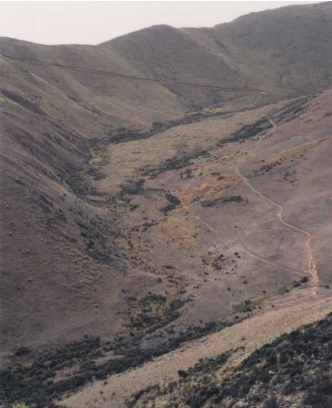
PLATE 3. THE MID ALTITUDE ZONE BETWEEN THE SHORT TUSSOCK (FOREGROUND) AND TALL TUSSOCK PLOTS (BACKGROUND); UPPER 1973, LOWER 1993. MAJOR CHANGE FEATURES ARE THE DOMINANCE OF HIERACIUM SPECIES ON LOWER SLOPE AREAS WITH DEEPER SOILS (NOT REPRESENTED BY THE SURVEYED PLOTS) AND THE LOCAL INCREASE IN SCRUB. THE PERSISTENCE OF MOST TALL TUSSOCK PLANTS IS A FEATURE.