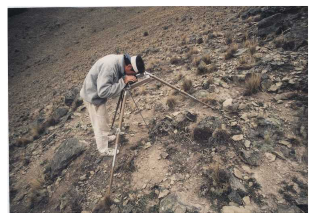
FIGURE 3. PHOTOGRAPHING GROUND COVER AT A PHOTOCENTRE IN THE SHORT TUSSOCK GRASSLAND AT PLOT 411