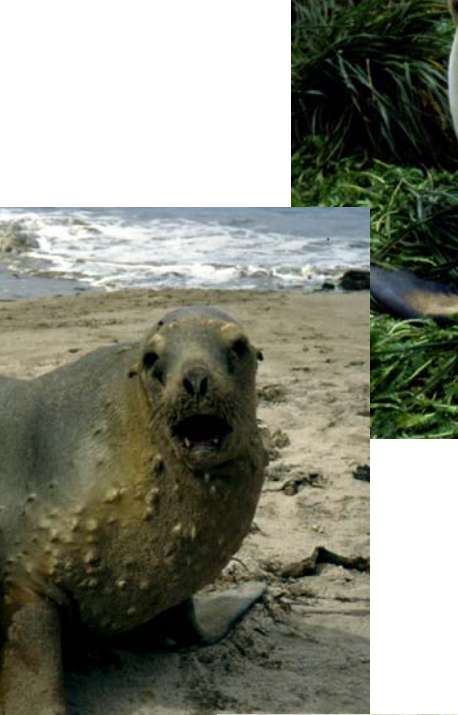
Adult female sea lion with thoracic and abdominal lesions.

Adult female sea lion with advanced throat swelling.