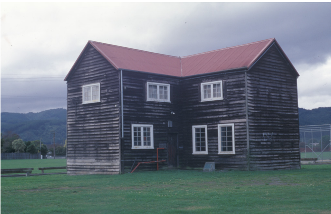
Figure 124. Corner blockhouse of Upper Hutt Stockade.

R27/146 (2682200E 6006500N); recorded 1983; also Wallaceville Blockhouse; Heritage New Zealand Category I registration No 207; Fig. 124.