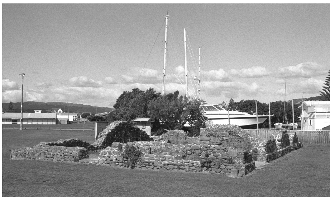
Figure 127. Paremata Barracks.