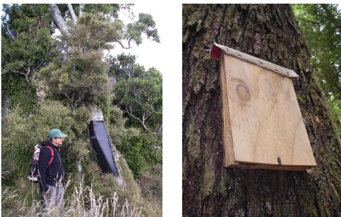
Figure 5. Closed cell foam cover (left) and plywood box (right) mounted on trees. These designs were developed by Bell (2009) and Francke (2005), respectively (photos: Marieke Lettink).

Two designs have been used for arboreal lizards in New Zealand: closed cell foam covers (see ' Case study A ') and plywood boxes (Fig. 5). These designs are known to be effective for detecting Hoplodactylus and Woodworthia geckos on islands free of mammalian predators (Francke 2005; Bell 2009). However, they appear to be ineffective in areas with low lizard densities and are not used by some species (e.g. Naultinus geckos; R. Muller, pers. comm.). Skinks have occasionally been found when checking foam covers (Bell 2009), suggesting that they may be useful for detecting arboreal species (e.g. striped skink Oligosoma striatum ). Construction details are described in Francke (2005) and Bell (2009).