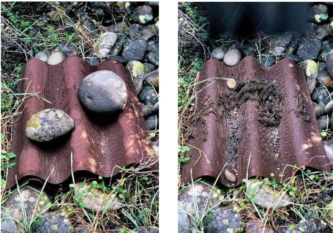
Figure 6. Checking a multi-layered Onduline artificial retreat. Small rocks were used to secure the retreat (left). Lifting the top sheet revealed a large group of geckos (right).

Onduline can be purchased from a number of sites (see www.onduline.co.nz for a local supplier). Full-sized sheets are 2 m x 950 mm and available in four colours (red, green, brown and black). While sheets can be cut to size with a hand saw, it is much easier to use a circular (skill) saw, which can cut stacks of five sheets simultaneously (or ask the supplier to cut it to size; this may require a small fee). Length-wise cuts should follow the troughs of the corrugations, making sure that the material is the right way up when it is cut (i.e. with the coloured and waterproof side facing up). To create multi-layered Onduline retreats, short (1–2 cm) lengths of 10-mm circular pine dowel are glued under the top sheets (see Lettink & Cree 2007).