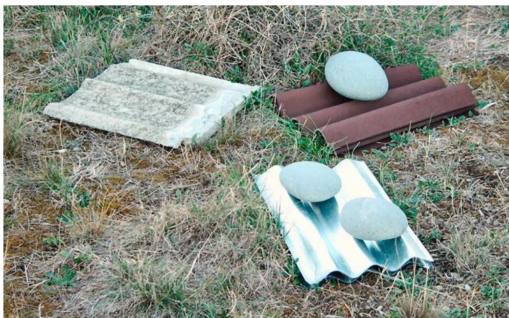
Figure 4. Artificial retreats designs tested by Lettink & Cree (2007): (1) concrete roofing tile; (2) triple-layered Onduline stack; (3) triple-layered corrugated iron stack.

Two sampling grids, each containing 30 clusters of the three retreat designs spaced 5 m apart in a 5 × 6 grid, were deployed in coastal shrubland near Birdlings Flat. The three retreat designs were: (1) a triple-layered Onduline stack, made up of three 400 mm × 280 mm sheets separated by small (short lengths of 10-mm diameter pine dowel) spacers; (2) a triple-layered corrugated iron stack, made up of 450 mm × 230 mm sheets set up with small spacers; and (3) a single 390 mm × 320 mm concrete roofing tile (Fig. 4). Iron and Onduline stacks were weighed down small rocks.