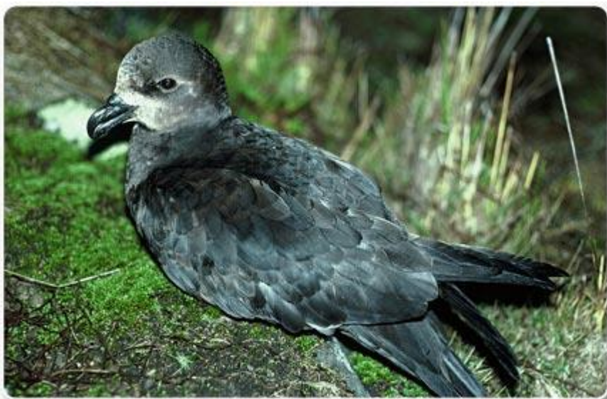
Grey-faced petrel, Mouthora (Whale Island).