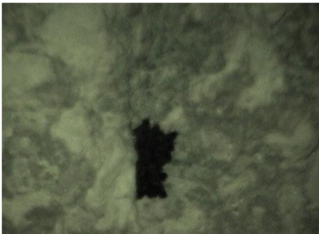
Figure 1. Photograph of a cluster of roosting long-tailed bats on the ceiling of Grand Canyon Cave (c. 50 m from ground). The image is a still photograph taken from an infrared video camera tape. Higher quality can be achieved with a still camera and zoom lens.

Counting bats inside roosts is a technique mostly applicable for inventory and monitoring of long-tailed bats because they occasionally roost in both caves and buildings. There are no current records of lesser short-tailed bats roosting in these structures, but their remains have been found in several caves, indicating they have used caves as roost sites in the past.