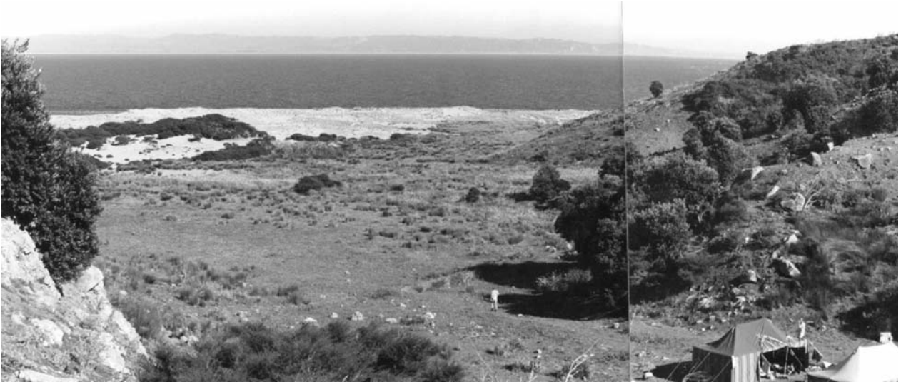
Hut Valley 1980. Low grassy turf and scattered club sedge. Turf maintained by rabbits.