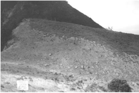
Figure 14: Photopoint 15—Head of Hut Valley, eastern side, 1990–2002