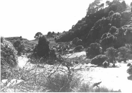
Figure 4: Photopoint 1—Duneland at Te Ratahi (McEwan’s Bay), 1979–2002