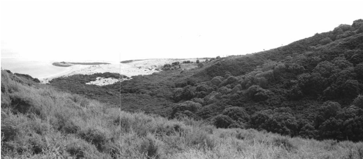
Hut Valley 2000. Dense tall kanuka scrub.