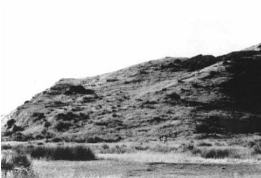
Figure 8: Photopoint 9E—Lower southern slopes of Raetihi (Pa Hill), 1952–2002