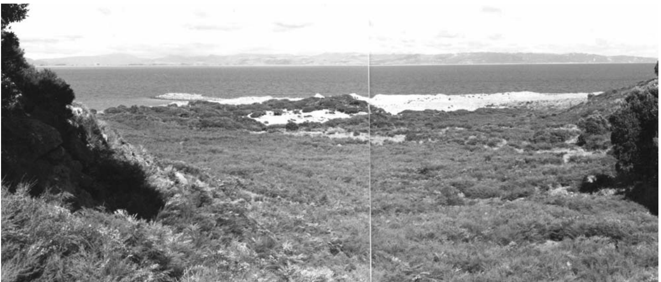
Hut Valley 1985. Dense sward of low kanuka scrub.