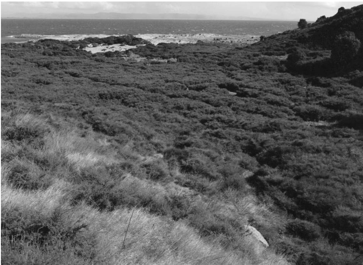
Hut Valley 1988. Dense kanuka scrub.