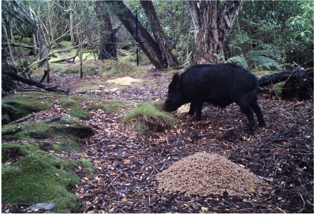
Figure 6. A pig ( Sus scrofa ) eating kibbled corn during the pig bait preference trial at Deas Head, Auckland Island.

In addition to the pig, a small black cat also interacted with the trial at Deas Head. This cat was first seen on day 5 and was recorded eating Bait-Rite paste on multiple occasions over the next 5 days and barracuda fish pieces on two occasions. The cat was also recorded eating within 3–5 m of the pig on multiple occasions, seemingly undeterred by its presence. In addition, a tabby cat and a smaller black cat also repeatedly visited the trial at Beacon Point from night 1. The tabby cat visited every night except for the second night, while the black cat visited on nights 4–7 but did not return after a fight appeared to occur between the two cats with the black cat submitting. Both cats spent time eating the barracuda fish pieces, which were fully consumed over the course of the trial, mostly in the last 3 nights. No other baits were consumed at Beacon Point.