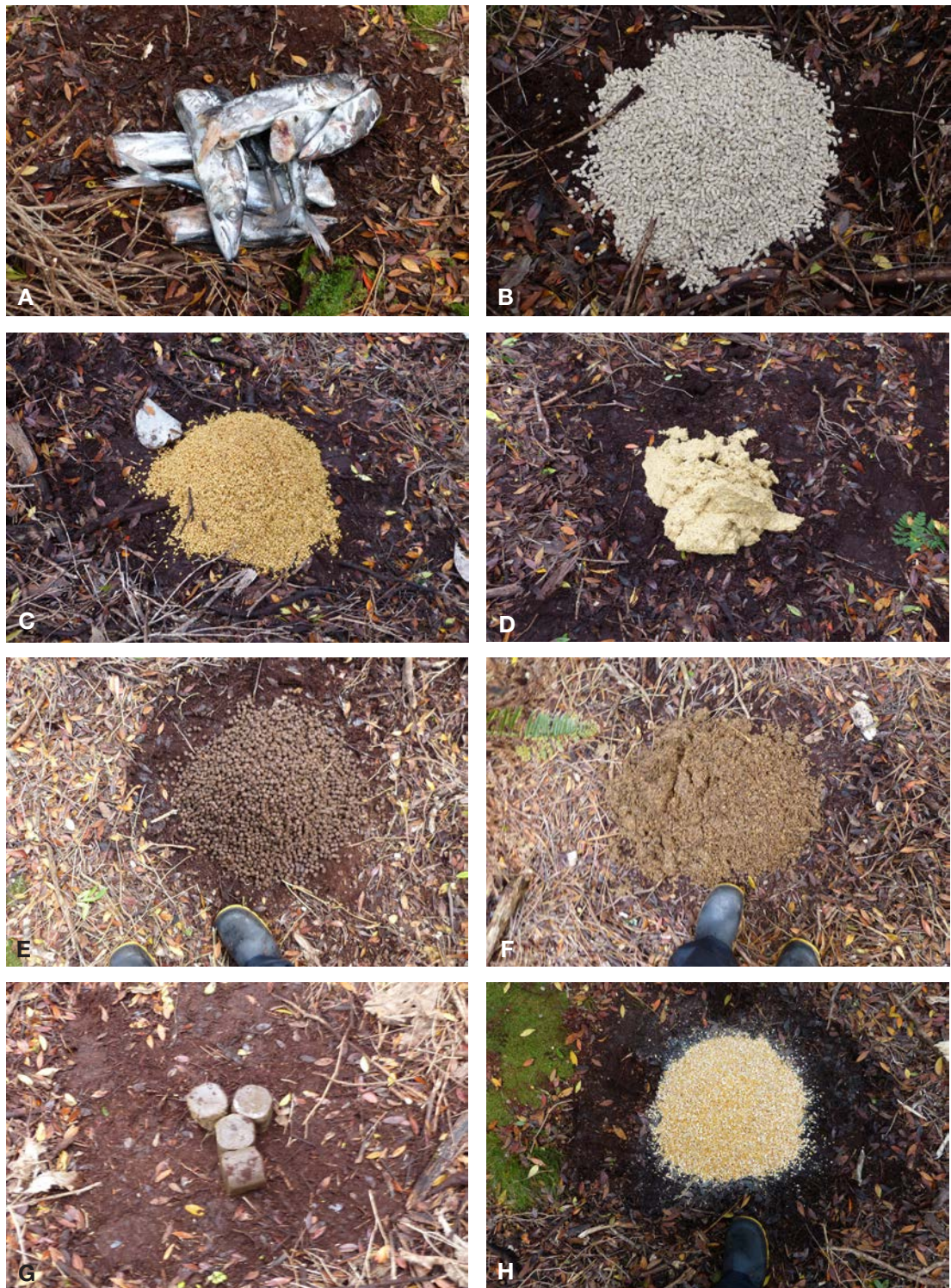
Figure 4. The eight bait formulations that were used in the pig ( Sus scrofa ) bait preference trials: A. fish pieces (barracuda); B. Porki Pig complete pellet (dry pellet); C. fermented barley (whole grain); D. Bait-Rite paste; E. salmon food (pellet form); F. brewers' mash; G. prawn bait cakes (pellet form); H. kibbled corn.

netting was then secured to the waratahs with lacing wire and the foot plates were pegged down using 35-cm-long pegs made from 12-mm ReidBar™. The total set up time was c. 30–60 min. A one-way gate was used that was set on a forward lean so that it closed with gravity and was set open by placing a long, thin stick horizontally between the gate and the frame to act as a hair trigger. A peg was placed in the ground behind the gate to stop it from opening past its balance point where it would no longer self-close 2 . Rubber strips were screwed onto the gate frame to