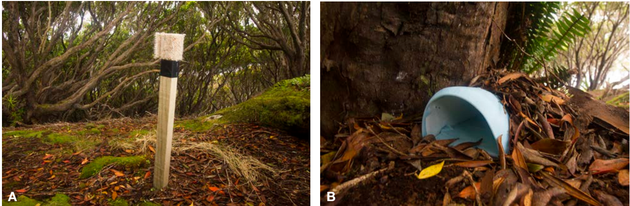
Figure 3. Devices used for non-invasive cat ( Felis catus ) hair sampling: A. scented rubbing pole and B. hair tunnel glue trap.

driving a 45-cm-long wooden stake 15 cm into the ground, placing a velcro strip near the top and attaching a piece of carpet above this that was scented with two sprays of catnip (Hagen) on each side; a 20-cm-diameter plastic plate was then nailed over the top to protect the pole from the weather. In addition, a hair tunnel glue trap (Faunatech) was established 5 m north of each rubbing pole and baited with one block of dried rabbit meat (Erayz#8, Connovation). Each of these was left for 5 nights before being recollected.