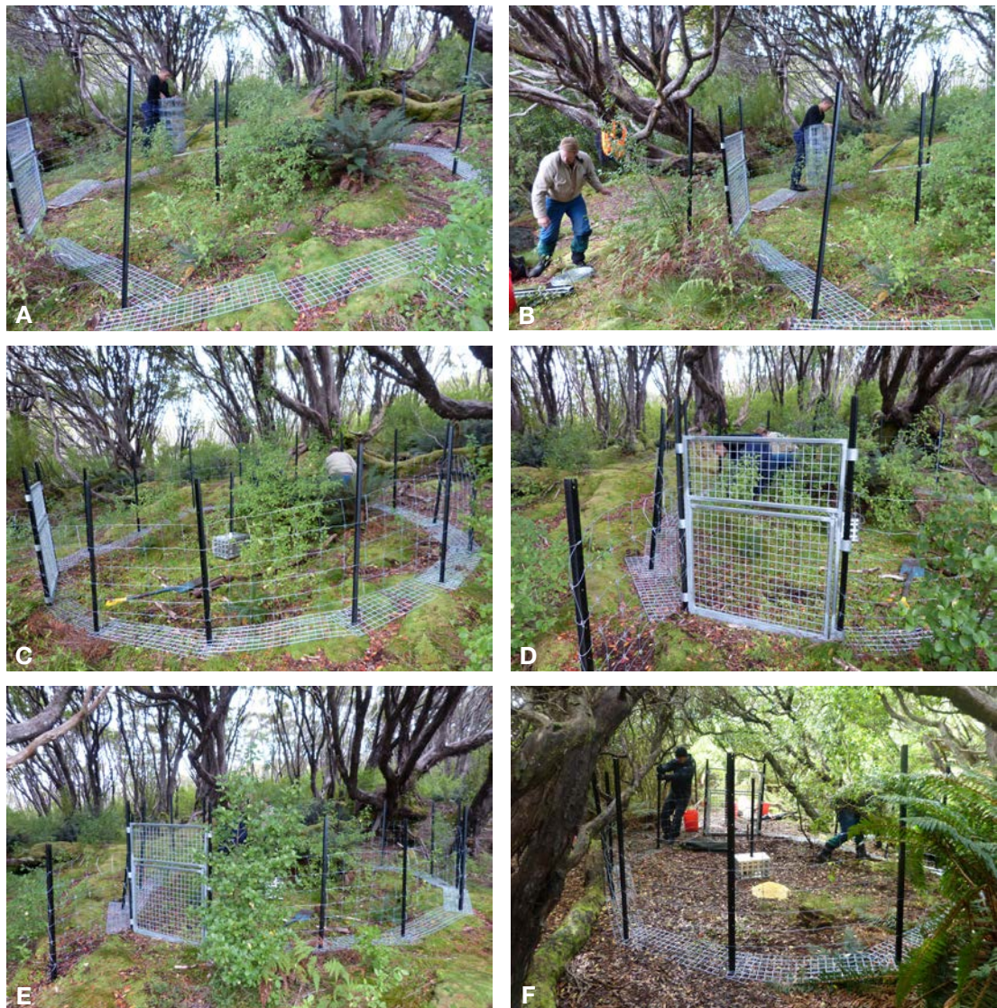
Figure 5. Corral-style traps used in the pig ( Sus scrofa ) trap trial. A–D. Set up of the pig trap at Terror Cove – note the lacing of waratahs through the netting and the set up of the one way gate; E. the completed pig trap at Terror Cove; F. the completed pig trap at Tucker Point.

pig often returned to eat crumbs from the ground where the corn had been piled even when significant amounts of the other bait types remained. At Beacon Point, no pigs had visited the bait trial after 9 nights.