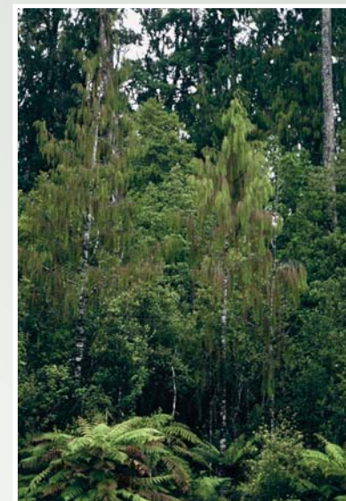
Changes in forest composition and regeneration trajectories. If the effect is at seedling level, the changes will be gradual, but if adult trees are affected, the response will likely be major and immediate, resulting in loss of forest dominants, and canopy collapse.