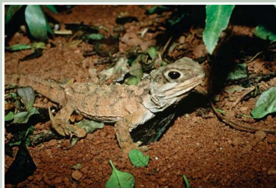
Loss of species endemic to New Zealand at a family level, such as tuatara ( Sphenodon spp.) and native frog species ( Leiopelma spp.) which have adapted to specific climatic conditions and are therefore extremely sensitive to changes in climate.