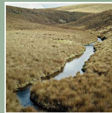
Changes in freshwater fish (e.g. Galaxias spp., Canterbury mudfish ( Neobanna burrowsius )) and invertebrate distribution and abundance due to drying and warming of streams, rivers and wetland ecosystems.