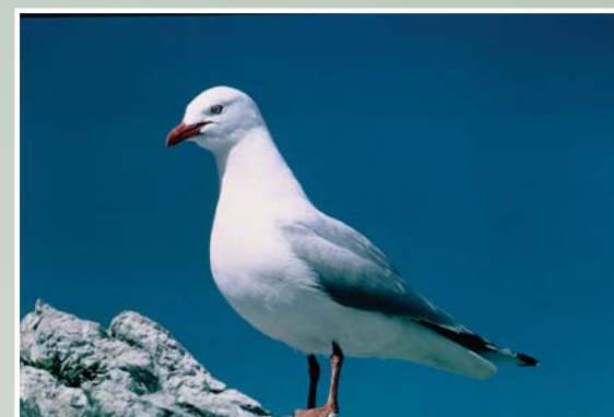
Population decline in red-billed gull ( Larus novaebollandiae scopulinus ) has been linked to the effect of climate change on food availability.