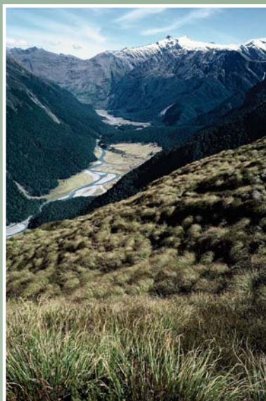
Reduced range of alpine ecosystems and associated loss of endemic plants and invertebrates due to rise in native tree line and increased weed pressure from wilding pines and other woody weeds.