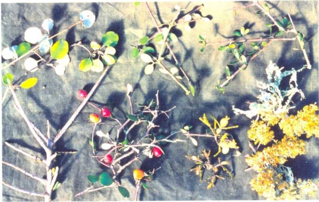
Fig. 3 Examples of the common plants of native scrub on The Pyramids, clockwise from top left: Helichrysum lanceolatum ; Coprosma crassifolia ; C. propinqua ; two lichens typical of the shrub crowns, Ramalina celastri (grey), and Teloschistes chrysophthalmus (yellow); a small semi-parasitic mistletoe ( Korthalsella lindsayi ), and korokio ( Corokia cotoneaster ) as both red- and yellow- fruited forms.