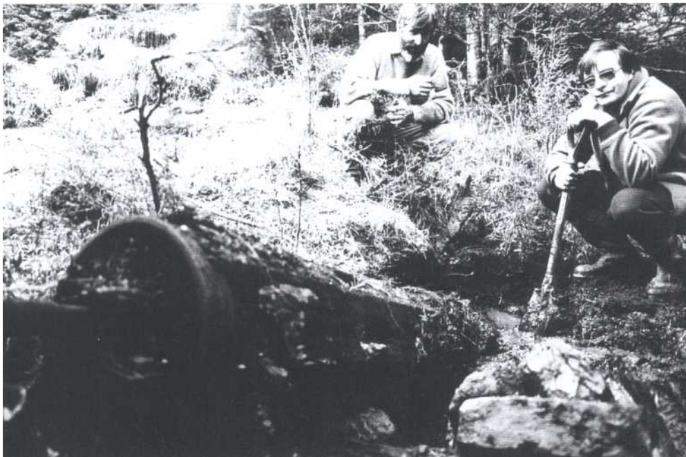
Photo 10: Whim spindle in mullock waste by the upper terminal of the aerial cableway.