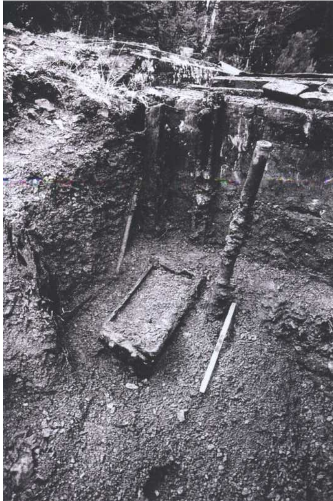
Photo 12 (below): Layout of piles of engine house (marked by white flashes) and the brick wall alongside flue (behind figure).