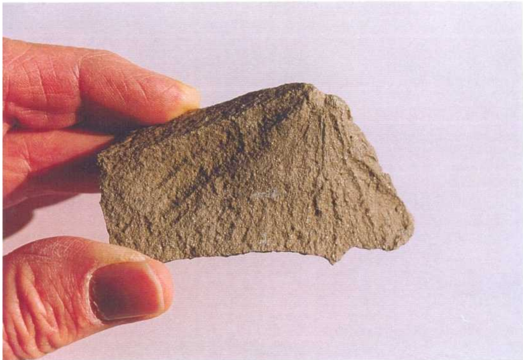
Figure 6. A spall of basalt from the hill above the Old Jetty.