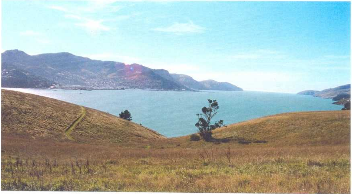
Figure 5. Photograph of Wards' cottage site 1999.