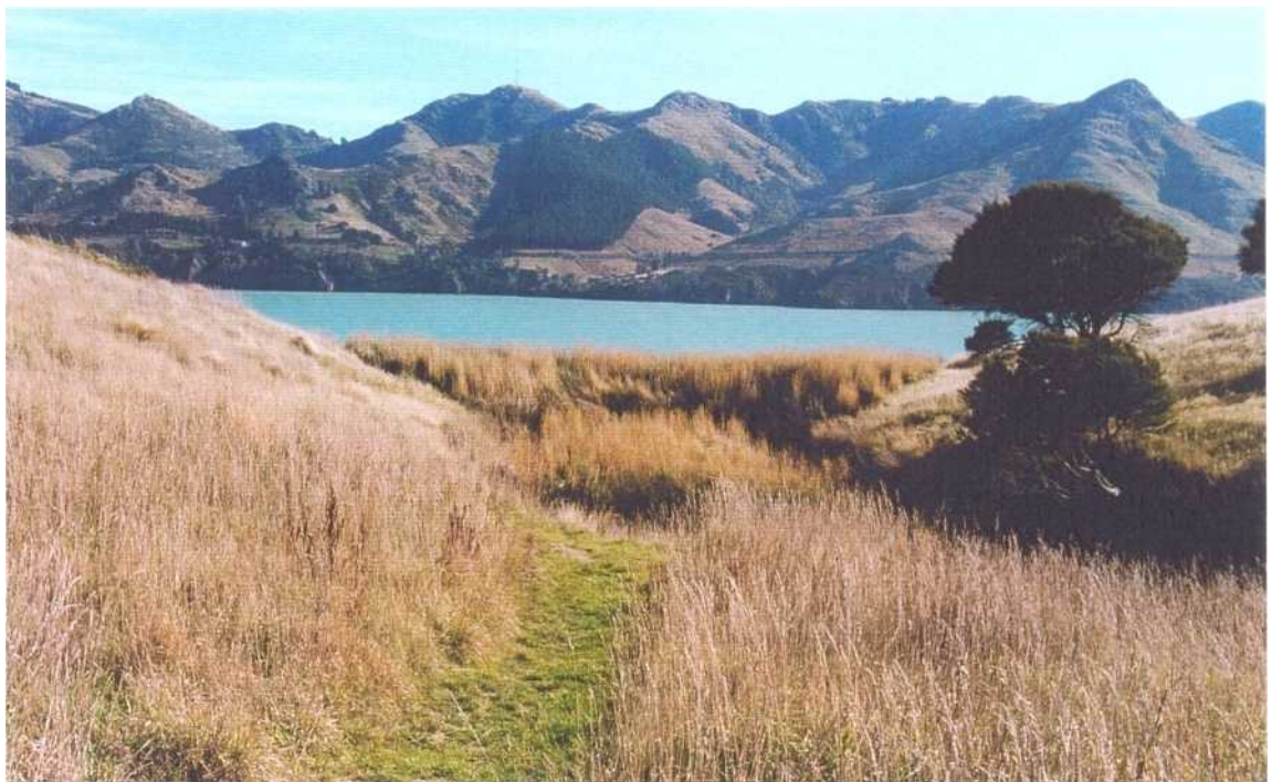
Figure 3. Historic stock water dam embankment. Planting is proposed on the slope on the right.