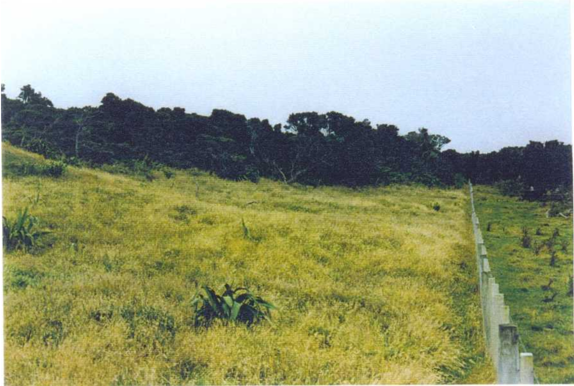
FIGURE 15 Rangaika Scenic Reserve near Plot 4, in 1990 (above) and 1996 (below). In six years there has been a dramatic increase in flax in the fenced-off grassland, and a thinning of tree canopies.