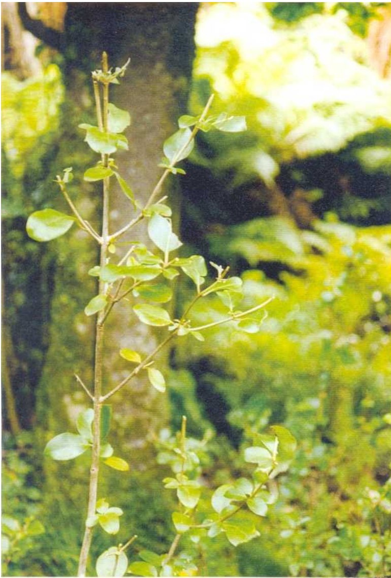
FIGURE 14 What's wrong in the forests of Tuku Nature Reserve: cattle browse on a karamu sapling (left); pig rooting upending seedlings and saplings (below).