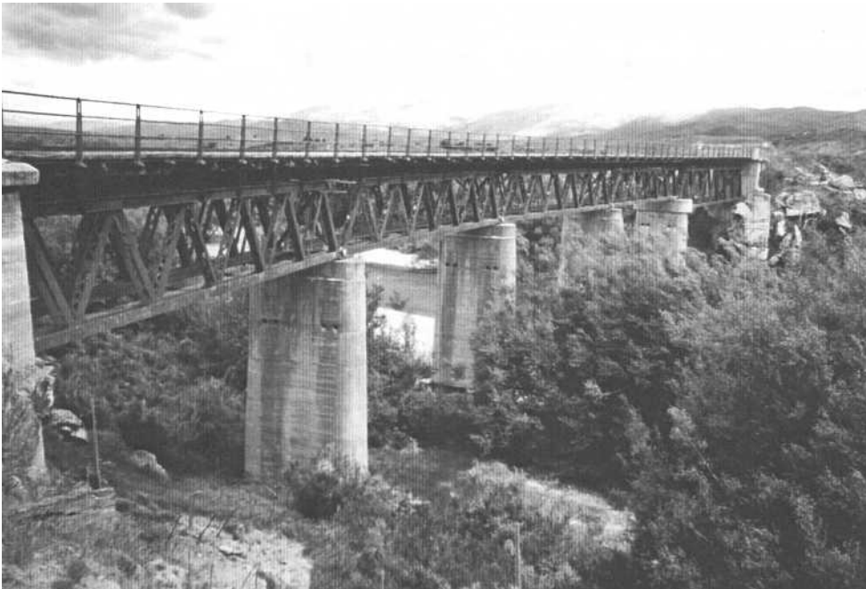
Figure 4a. Some examples of Railway style railings Top left: a side bridge at Ida Valley. Top right: Hyde township bridge showing railings and doubled up piles and raker braces. Lower left: Manuherikia No 1 bridge (No-70), the longest bridge on the trail, showing its concrete piers and metal railings.