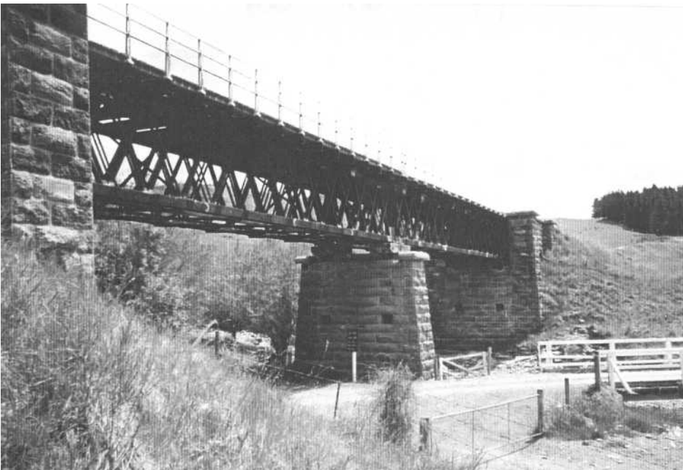
Figure 4 Bridges between Middlemarch and Ranfurly.

Top left: The trestle bridge over Heeneys Creek.