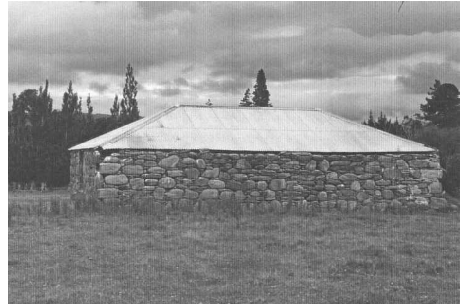
Figure 2 Examples of masonry - wholly, partly and not brought to course. Top left: the schist masonry abutments of the Poolburn viaduct fully brought to course Top right: the basalt masonry of the Dunedin railway station partly brought to course. Bottom left: the Geology building, University of Otago, with a sandstone foundation brought to course and basalt wall partly brought to course. Bottom right: the shearers' quarters at Taieri Lake station rubble built and not brought to course.