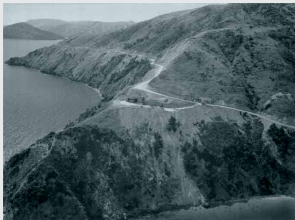
Figure 2. View of first gun emplacement on Blumine Island (Oruawairua) and road to second emplacement.

Photo: NZ Aerial Mapping (F516, taken 1944).