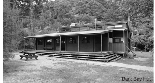
Bark Bay Hut