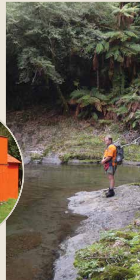
Historic Kahunui Hut