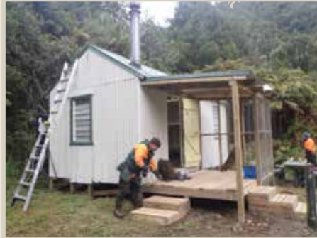
DOC staff working on Koranga Forks Hut

Most of the track is in the river; a large orange track marker on the true right indicates the exit onto the benched track. From here it takes about 30