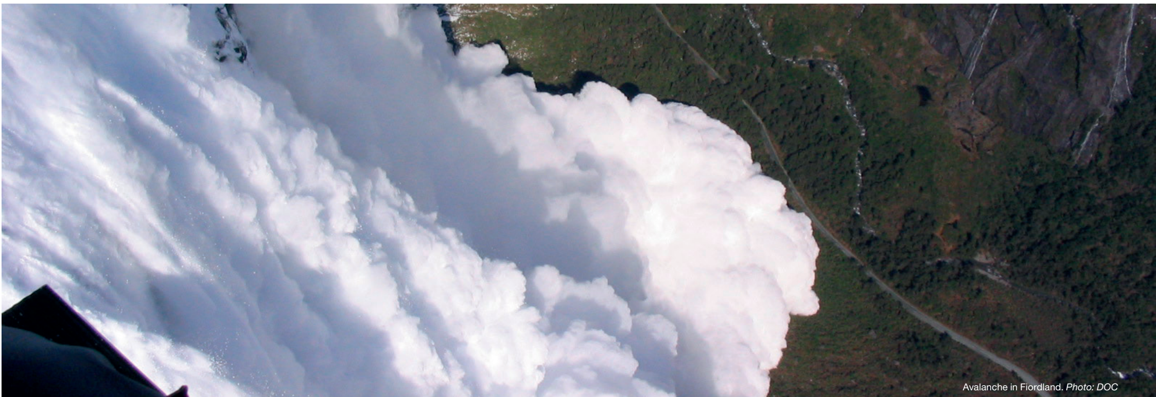
Avalanche in Fiordland.