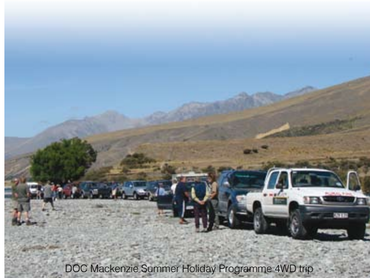
DOC Mackenzie Summer Holiday Programme 4WD trip

Vehicle access to Baikie Hut—Pukaki Downs Station 03 435 0131