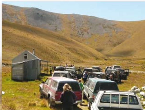
DOC Mackenzie Summer Holiday Programme 4WD trip

This well-formed track climbs steadily up to Omarama Saddle (1260 m), however, the upper section of track is narrow in places and prone to slips. From the saddle it is a steady descent into the west branch of Manuherikia River. From Omarama Saddle to Top Hut (standard, eight bunks) it is a distance of 2 km. Continuing on down the West Manuherikia Track there is another hut, Boundary Creek Hut (standard, eight bunks) which is 8 km from Top Hut. At the track end drivers have the option of continuing out to Hawkdun Runs Road and on to St Bathans.