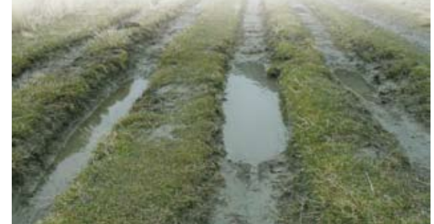
Cover: Macaulay River valley

Published by Department of Conservation Canterbury Conservancy Private Bag 4715 Christchurch © Copyright 2009