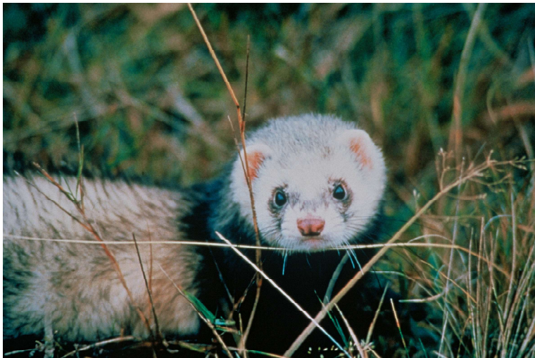
Ferret, showing upper body and head.

Stoats and other mustelids will eat native and endemic birds, their chicks and eggs, invertebrates, rodents, lizards, hedgehogs and fish. They are carnivores and only eat other animals. Stoats can climb trees and swim a few kilometres, and they hunt day and night.