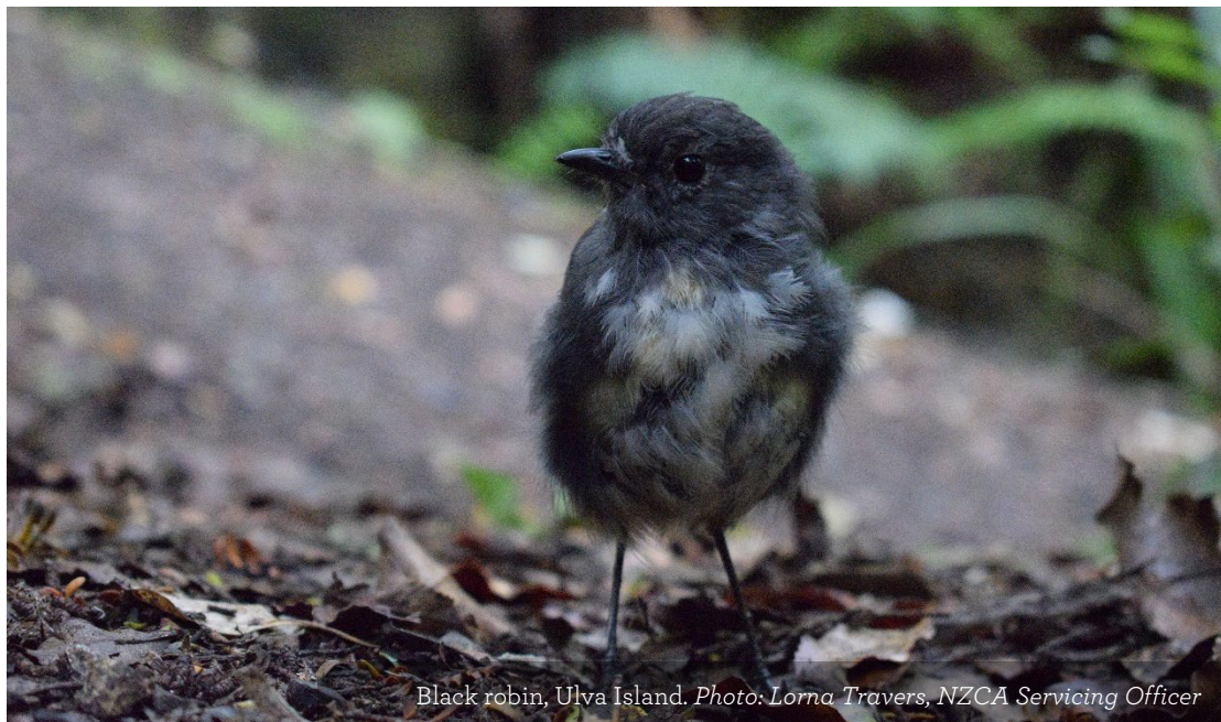
Black robin, Ulva Island.

The term of all Authority members ends on 30 June 2020.