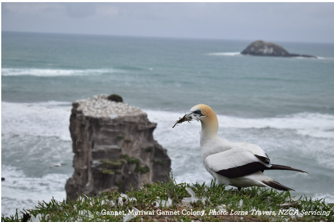
Gannet, Muriwai Gannet Colony.