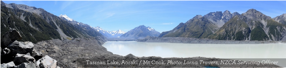
Tasman Lake, Aoraki / Mt Cook.