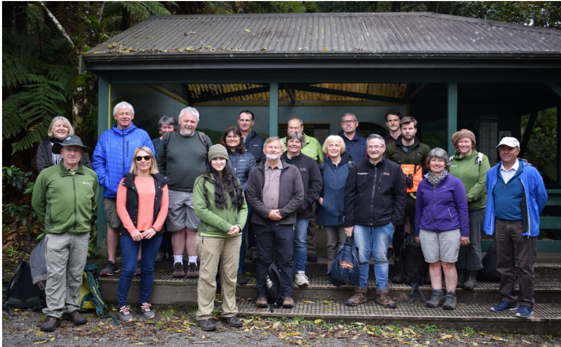
NZCA members, Waikato Conservation Board members and Department staff at the start of the Mangakara Nature Walk Track, Pirongia Forest Park.

The New Zealand Conservation Authority Te Pou Atawhai Taiao O Aotearoa (the Authority) met on six occasions during the year – in August, October and December 2019, and in February, April and June 2020. The October meeting was held in Hamilton, with the Waikato Conservation Board, and included a field trip to Pirongia Forest Park and Lake Ruatuna.