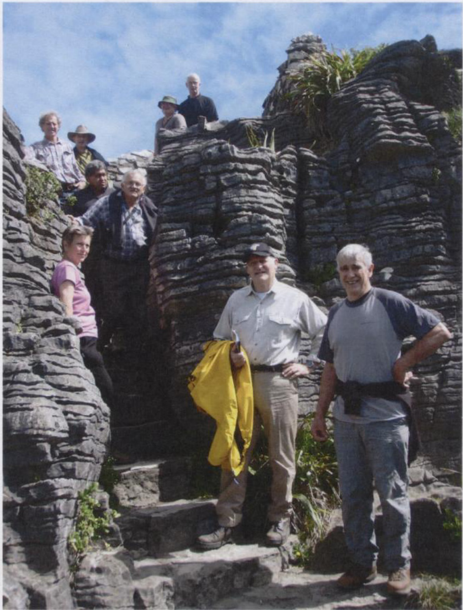
Pancake Rocks at Punakaiki