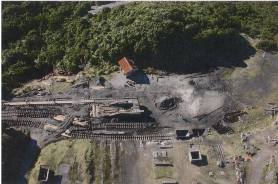
Denniston Brake head

At times some members were not always able to attend the planned field inspections but overall attendance by members has been high.