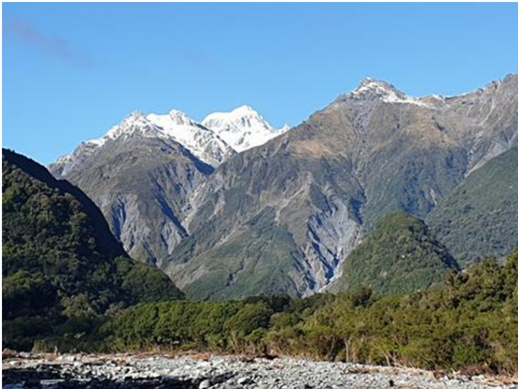
Fox Glacier Valley