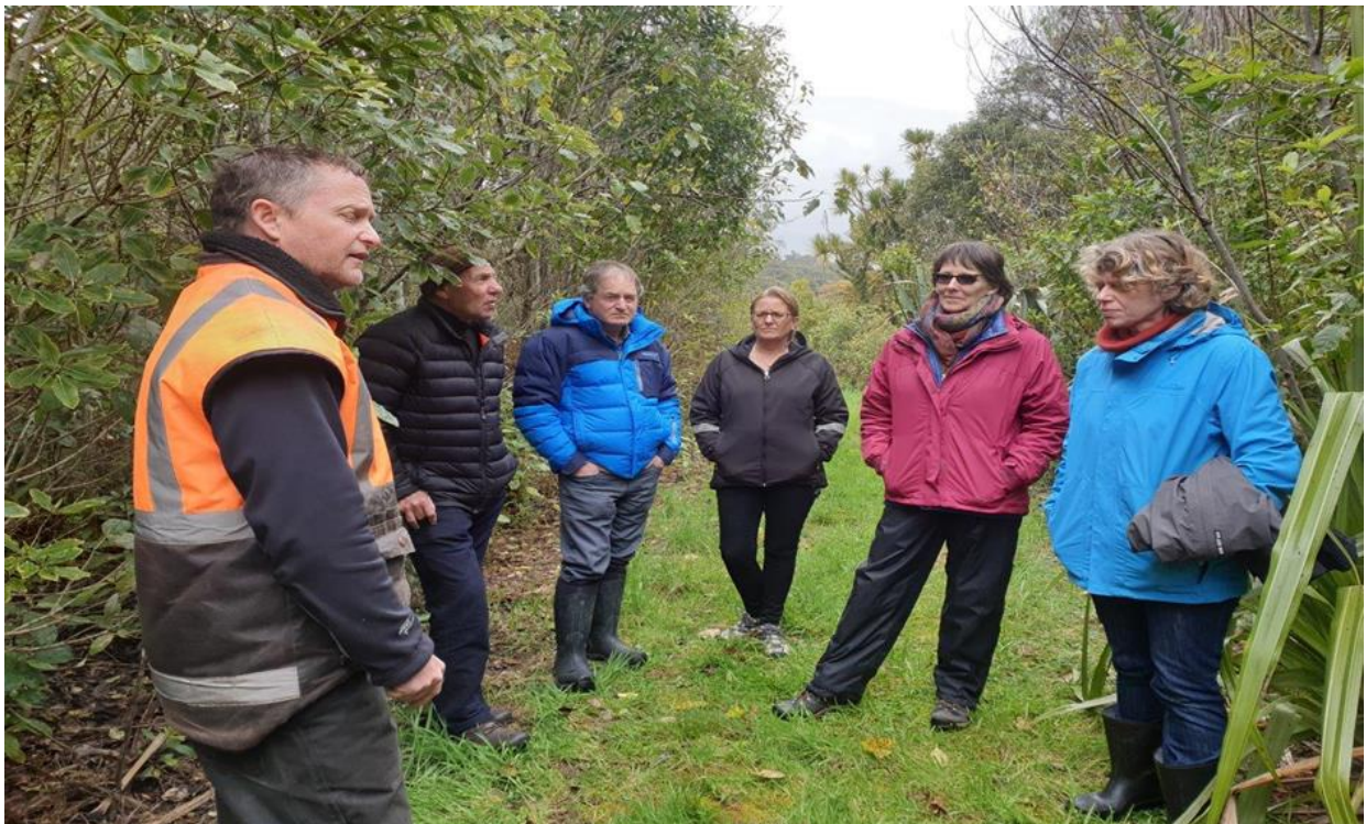
Photo: Boards members visit CVNZ plantings on the Barrytown flats

Due to poor weather, the Board had to limit their field trip day, but with a break between showers, they managed to visit the Hector Landfill that is being exposed by coastal erosion north of Westport. This is of interest to the board as they have been focusing on old landfills on the West Coast, particularly those vulnerable to coastal or river erosion.