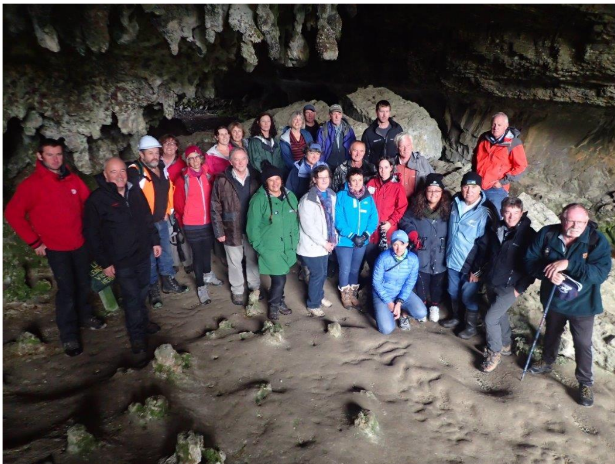
West Coast Tai Poutini and Nelson/Marlborough Conservation Board at the Oparara Arches.

The Board had a joint meeting with the Nelson/Marlborough Board and a field trip to the Oparara Arches. This was timely after presentations from the Oparara Trust and lots of discussion at the Public meeting about the area.