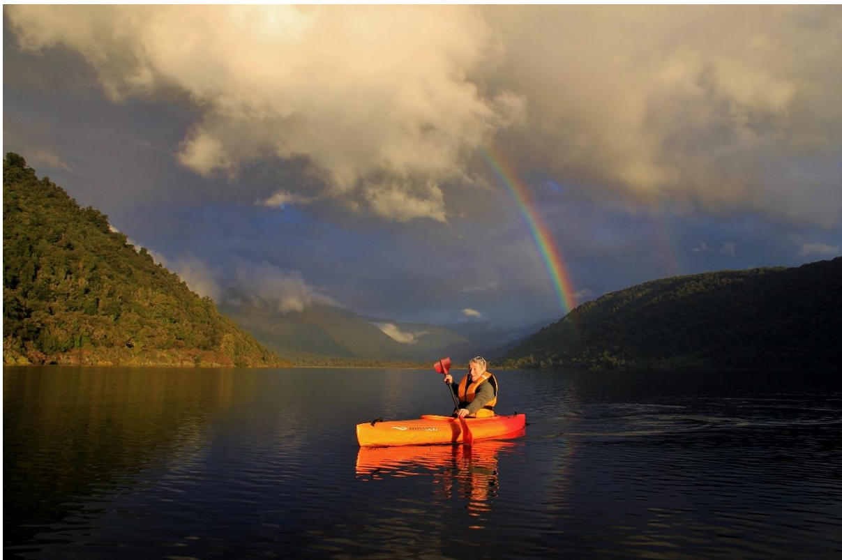
Lake Moeraki Scenic Reserve

There are two national parks within the Board’s region: Paparoa National Park and Westland National Park. The Board has sub committees involved in the management plan review for these. The Board also advocates for cross boundary issues with Kahurangi National Park (which is the responsibility of the Nelson Marlborough Conservation Board), Arthur’s Pass National Park (Canterbury Aoraki Conservation Board) and Mt Aspiring National Park (Otago Conservation Board).