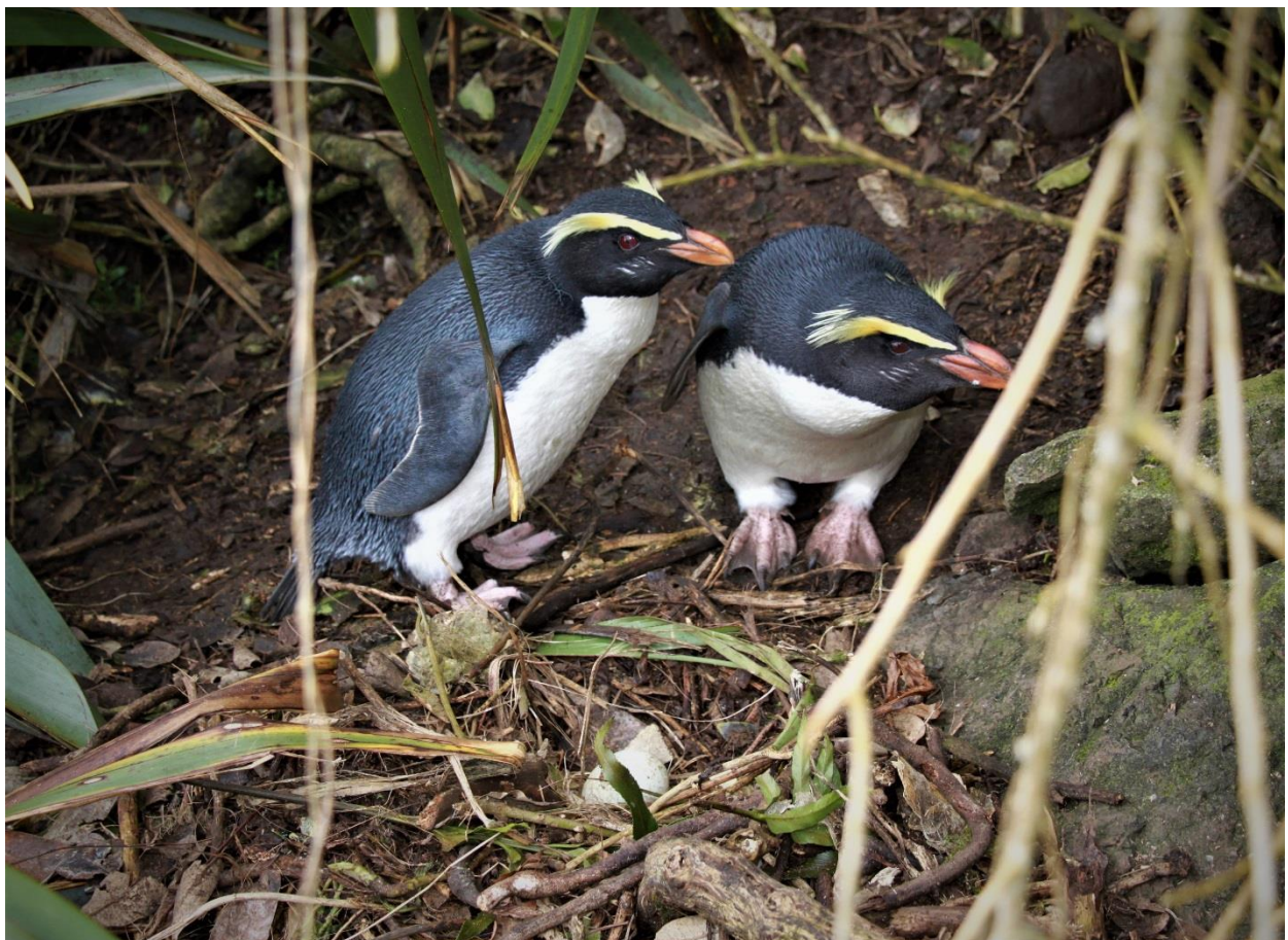
Tawaki penguins at their nesting area, South Westland.