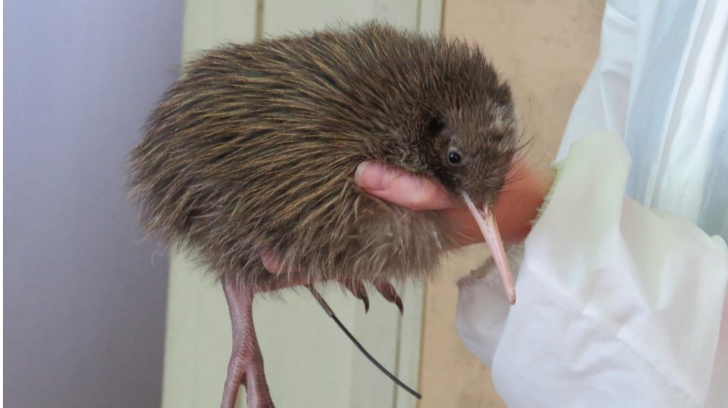
Baby Tokoeka Kiwi - Haast