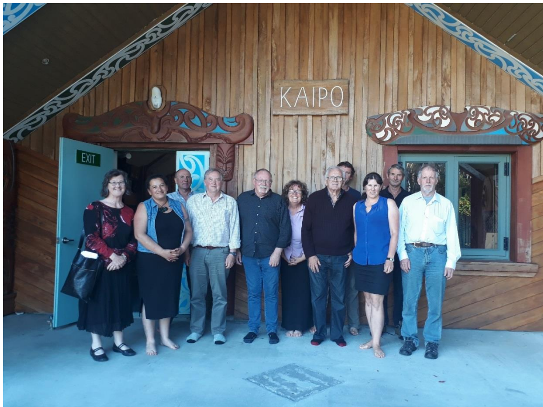
The Board outside the Bruce Bay Marae where they held the November meeting.