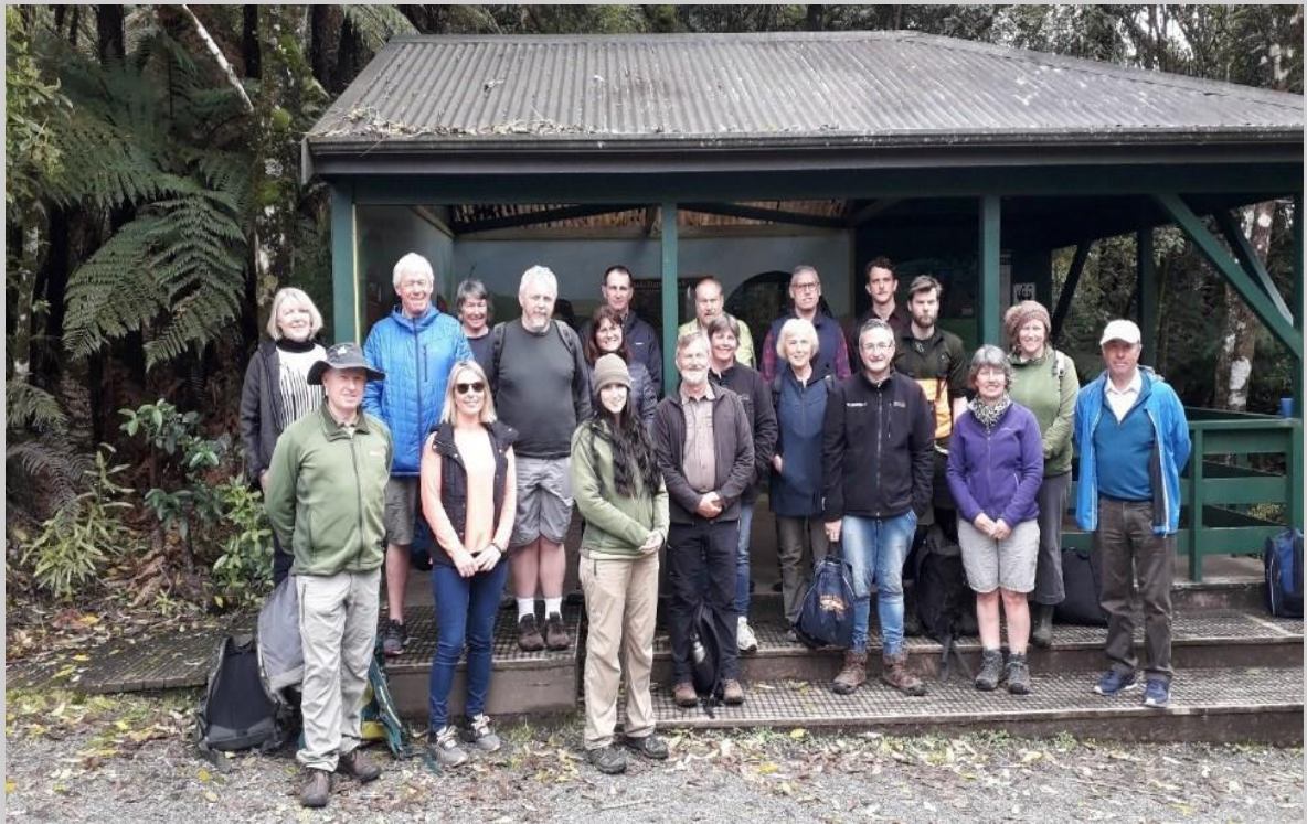
NZCA / DOC - Pirongia Forest Park – 7 October 2019

The New Zealand Conservation Authority (NZCA) held its October meeting in Hamilton on the 8 th October, with a field trip, hosted by Waikato District DOC staff, to Pirongia Forest Park, on the 7 th of October. The Conservation Board joined them on this excursion.