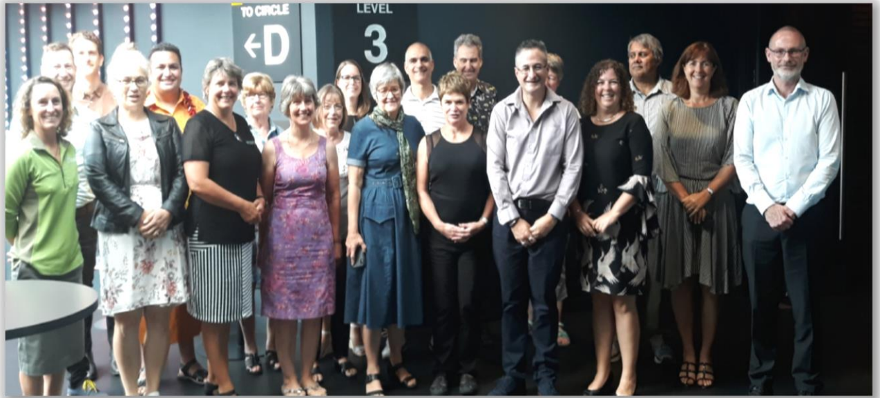
February 2020 - Waikato/Auckland Conservation Board Joint Meeting attended by Hon Eugenie Sage, Minister of Conservation, at the ASB Waterfront Theatre, Auckland.