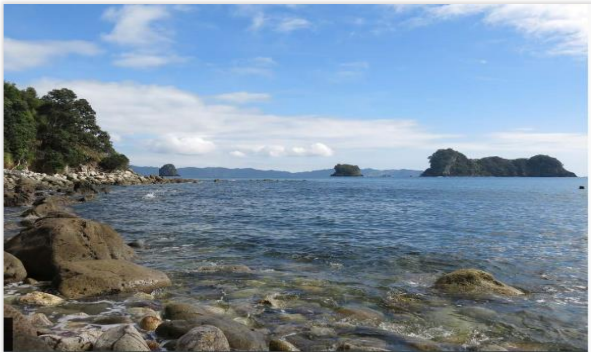
Rocky Beach at the Marine Reserve