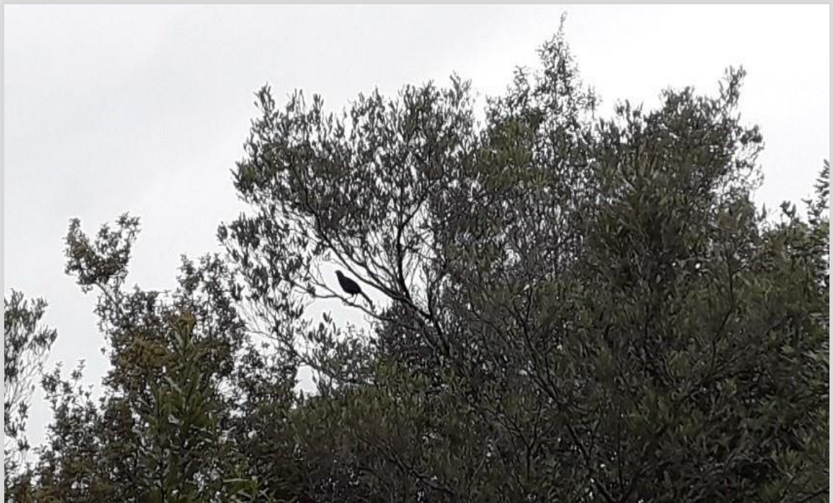
Kokako - Pirongia Forest – 7 October 2019

Following presentations and prior to walking the Mangakaara Bush Loop Track members were very fortunate to see two kokako.