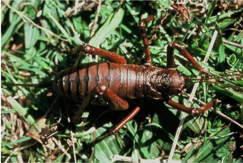
Mahoenui giant weta.

Previously considered extinct, rediscovered in an area of King Country gorse and features in the Waikato CMS