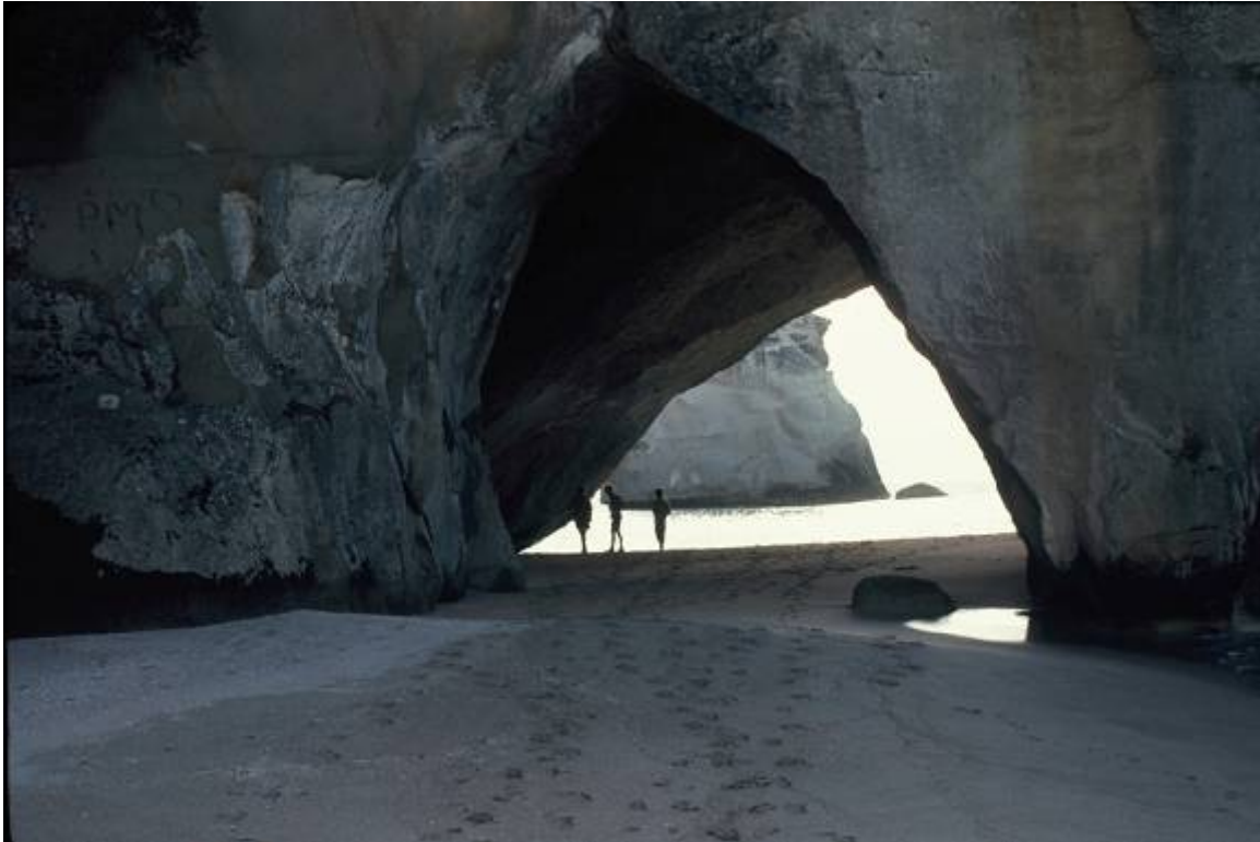
Cathedral Cove, Coromandel

to Whitianga and an upcoming multi agency meeting with the Waikawau Bay Community to discuss proposed works in the area