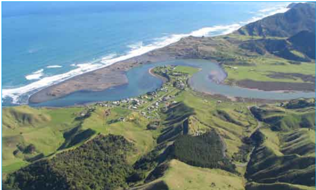
Marokopa township, coastal settlement in the north-west corner of Maniapoto Area.