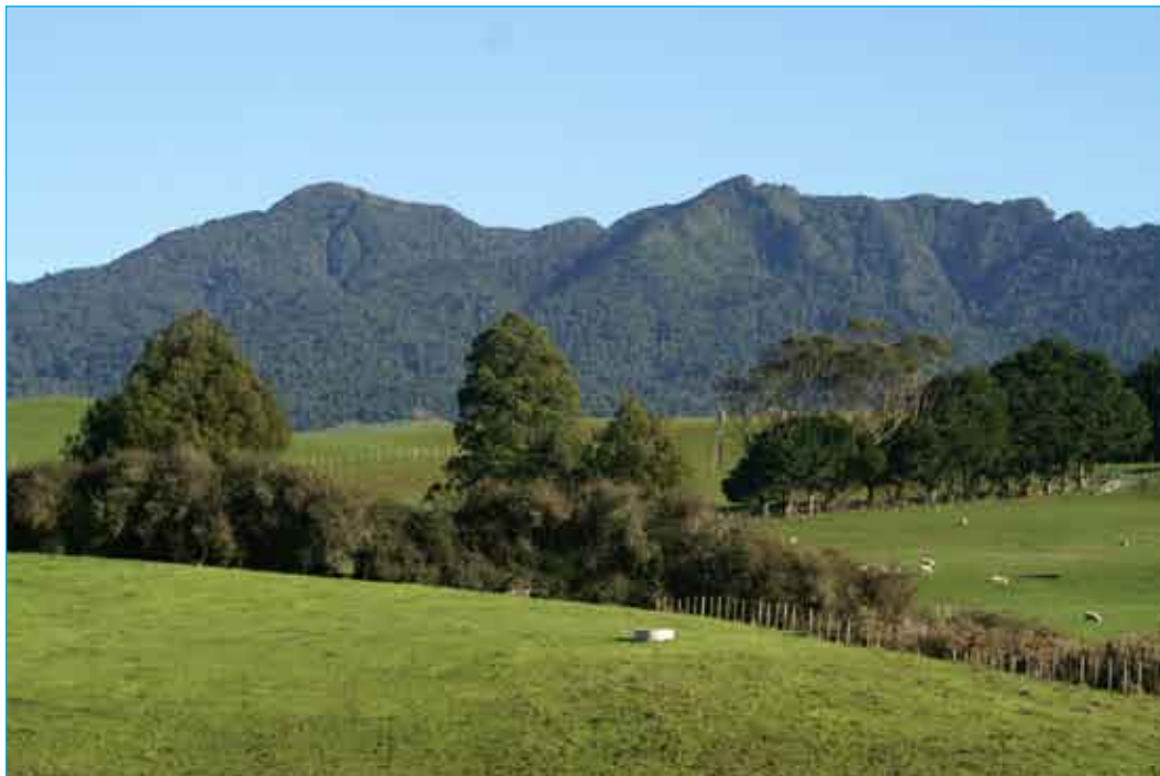
Mount Karioi, iconic west coast landmark under Waikato Area management.

There are large rural and urban centres (Hamilton, Te Awamutu, Morrinsville, Cambridge, Matamata, Raglan, Ngatea) within the Area supporting a regional population in excess of 380,000 people. Industrial development, intensive use of land for agriculture and increasing demands for outdoor and recreational opportunities and experiences from growing populations, pose challenges for the retention of indigenous character and biodiversity within the Waikato landscape.