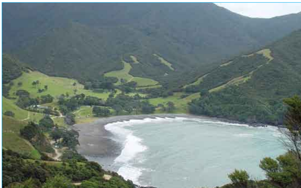
Hauraki Area landscape: Stony Bay, northern Coromandel Peninsula, with Moehau Range in backdrop.

Hauraki: The Hauraki Area covers the scenic and wonderfully diverse Coromandel Peninsula. The Peninsula is traditionally known as Te Tara o Te Whai (the jagged barb of the stingray), and is the figurative ama (outrigger) that has Mt Te Aroha as its prow and Mt Moehau as its stern. The area is known for its kauri-cloaked volcanic ranges, rocky coastal headlands, sandy beaches, bays and estuaries. The coastline is dotted with islands and nationally significant sites for many of our threatened species.