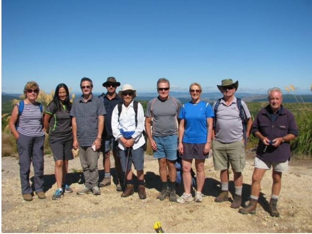
About to set off on the Timber Trail. Behind is a view of the catchment of Ongarue to the south end of the trail, onto Okahukura maunga and Mt Taranaki