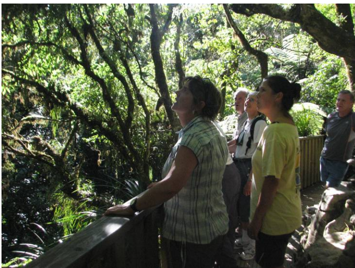
Board members experiencing Ruakuri track after the Board meeting and learning about the local bush and history of the area.