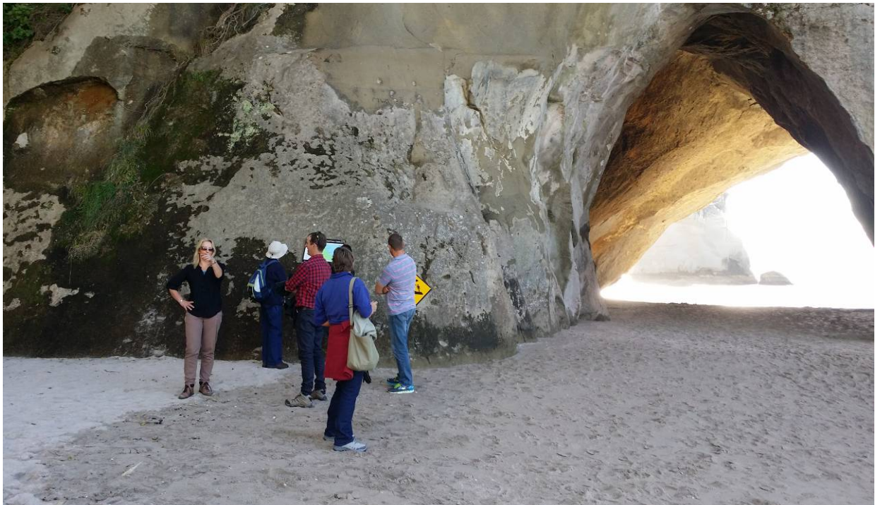
Checking out Cathedral Cove and the interpretation and warning signs mentioned as visual pollution by Ngati Hei

The Board then visited Cathedral Cove which is the smallest "Place" in any CMS which reflects the magnitude of integrated management required in this small but significant cultural site and tourist destination. The visit was to provide visibility of this Place and possible CMS direction to the Board i.e one of the CMS milestones which may be deferred as the integrated plan is to be reviewed as part of the Hauraki Treaty settlement.