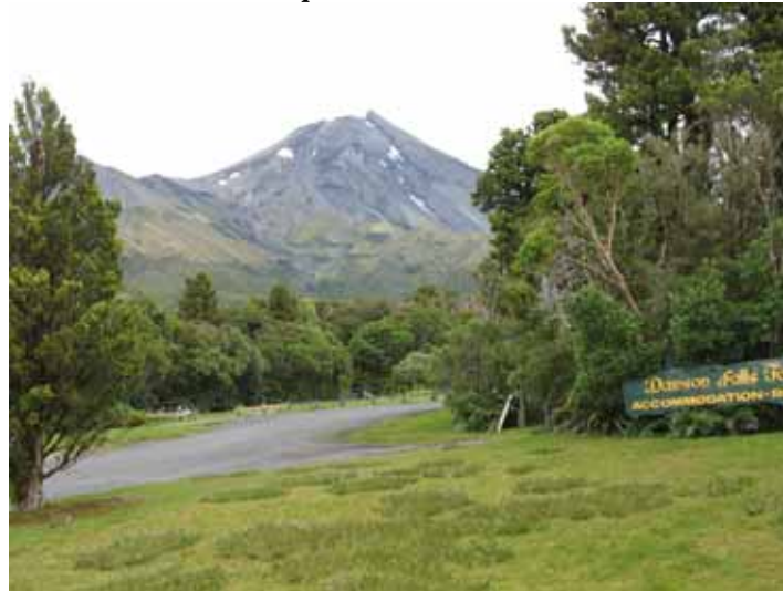
View of Mt Taranaki from the Dawson Falls Visitor Centre