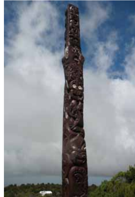
Te Pou Whenua o Nga Ruahine Dawson Falls Visitor Centre

Following the successful establishment of a regional forum with Taranaki iwi, the Board was advised in its October 2009 meeting that a similar forum had been formed with Whanganui iwi. It was evident that iwi wished to be involved at the highest level of engagement with regard to the CMS and national park management plans.