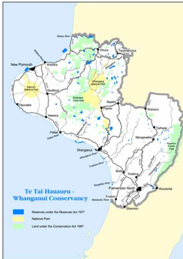
Map of Taranaki/Whanganui Conservation Board Area