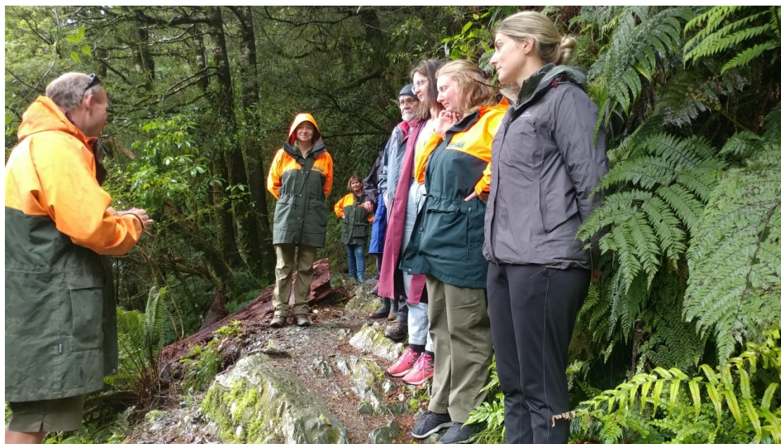
Above:: Southland Conservation Board members being updated on the Southern South Island Flood Recovery work taking place in Fiordland.