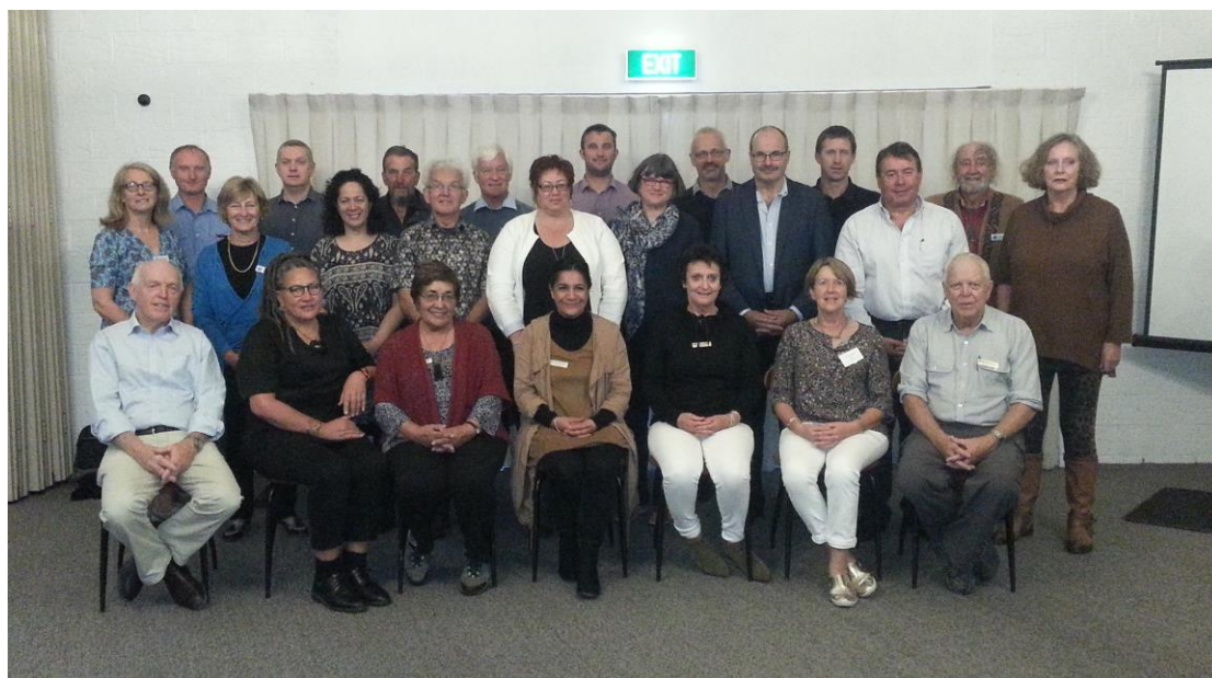
Nelson Marlborough and Canterbury Aoraki Board members with the Director General at Hanmer Springs

Royal Forest and Bird Protection Society of New Zealand representatives regularly attend Board meetings. Other organisations with occasional attendance include Fish and Game New Zealand, Federated Mountain Clubs of New Zealand, and Nelson Tramping Club.