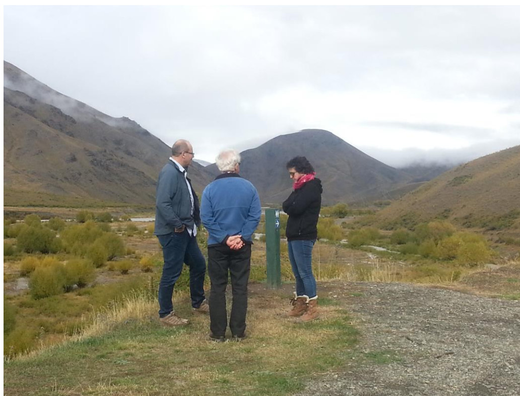
Board members in the Molesworth with the Director General

Members were impressed overall with the progress made and the range and amount of work completed.