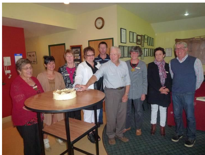
Cutting the cake at the 100th Nelson Marlborough Conservation Board meeting