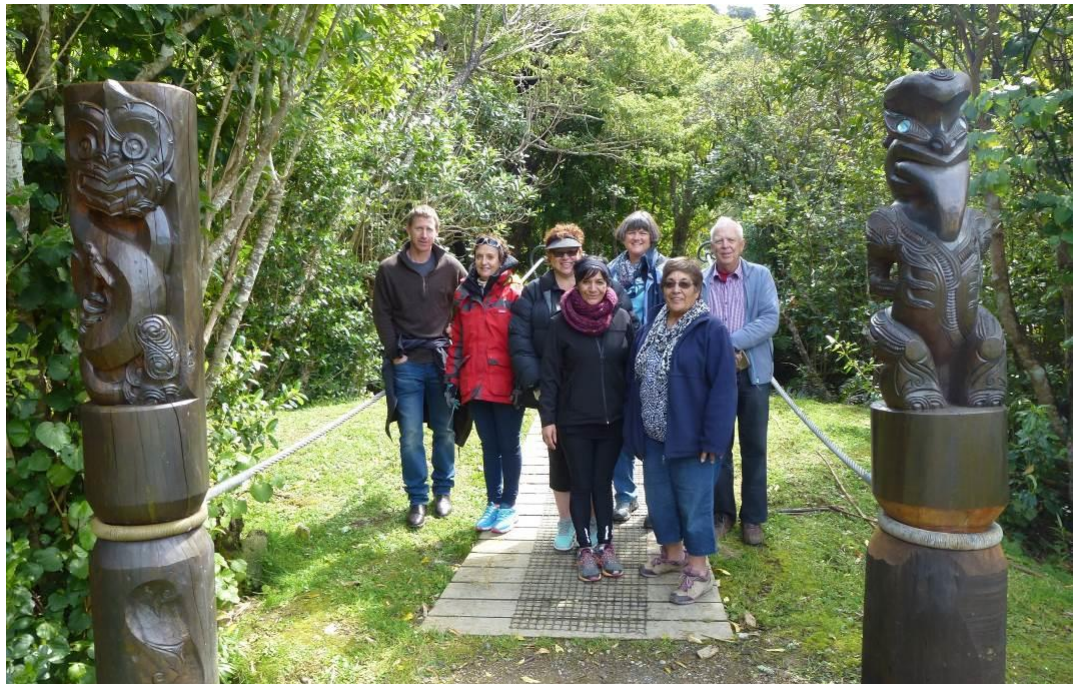
Board members at Ship Cove

The Board also wrote to the Minister of Conservation in June 2017 to comment on the process used in the MPI proposal for relocation of salmon farms in the Marlborough Sounds.