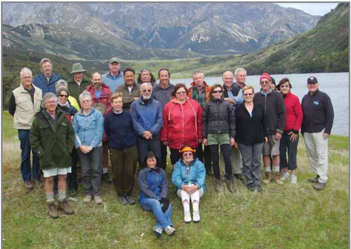
Members of Canterbury Aoraki and Nelson/Marlborough Conservation Boards and DOC staff at Lake Guyon

Members of both boards went on a field trip into the St James Conservation Area arranged by DOC's Waimakariri Area staff. The St James Conservation Area is adjacent to both Molesworth Station and Nelson Lakes National Park, both of which are in the Nelson/Marlborough Conservancy. The Board appreciated seeing this area and hearing the Department's intentions for its management.