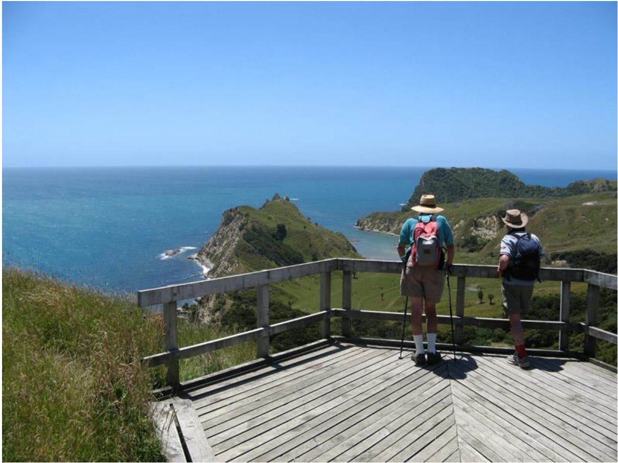
Photo: Cooks Cove Walkway.