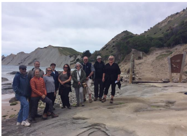
Photo: Board visiting Cape Kidnappers Gannet Reserve viewing the beach erosion on public access road.

The reserve is special in that it contains several marine habitat types, including boulder bank area, rocky intertidal platforms and a sheltered bay that is perfect for snorkelling.