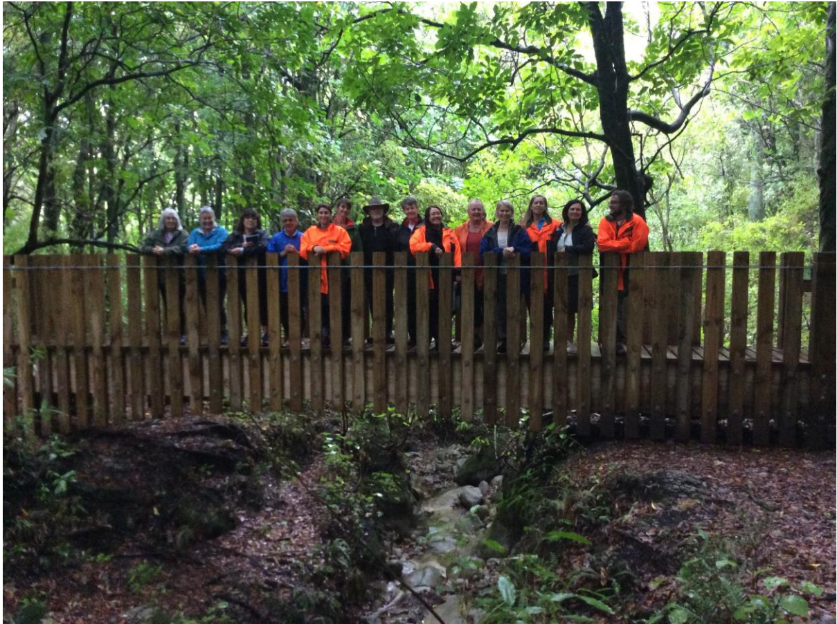
Photo: East Coast Hawke's Bay and Chatham Islands Conservation Boards at Longbush Reserve standing on bridge constructed by EIT carpentry students and sponsored by Williams Trusts and ECT