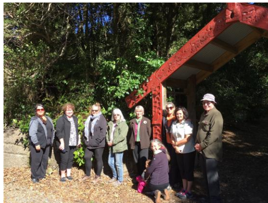
Photo: The Board at the Boundary Stream entrance

April 2017 : The Board joined department staff celebrating 30 years of DOC in both Gisborne and Napier.