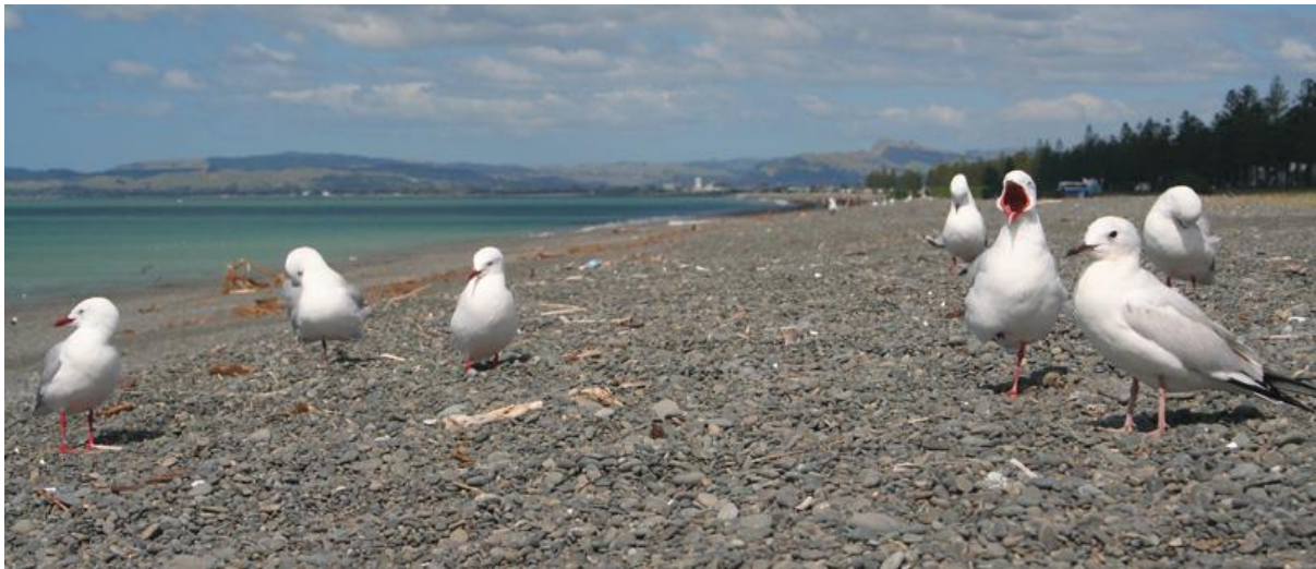
Photo: Red Billed Gulls Napier.

One board member attended the Nelson office hapu and whanau training session Pukenga Atawhai, in December 2016, which covered local iwi history, iwi organisations and Treaty settlement issues.