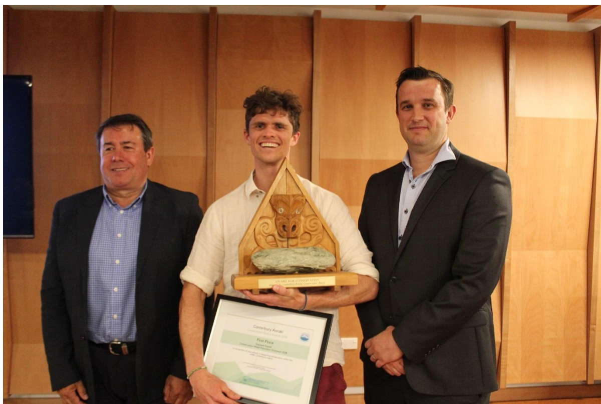
Recipient of the 2018 Award and Trophy - Squawk Squad

This year's recipient of the Canterbury Aoraki Conservation Board Award and $3,000 towards their project, was Squawk Squad. Squawk Squad is a social enterprise founded in New Zealand and their kaupapa is to connect and engage kiwis in the protection and growth of our native birds. Their approach is about taking conservation to the grassroots level by engaging our rangatahi to become the kaitiaki of our lands and multiply the impact by educating their whanau and beyond.