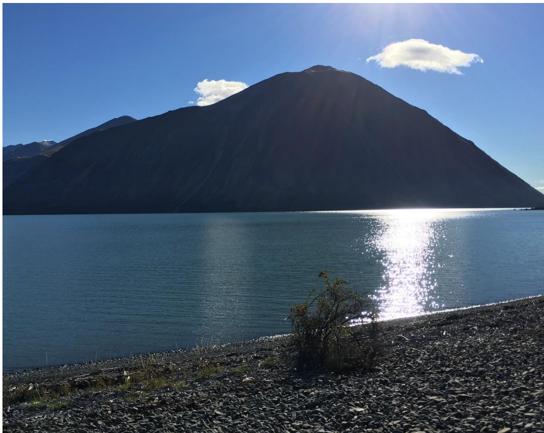
Ben Ohau