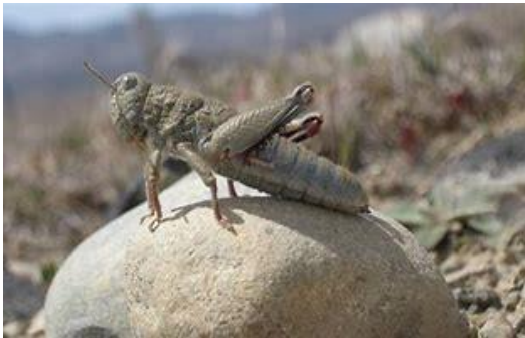
Robust grasshopper ( Brachaspis robustus )