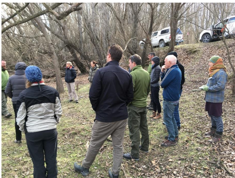
Predator Control Briefing, Rangitata

This was an extensive field trip with excellent presentations from DOC staff on the special environment of the Rangitata River as a braided river. The Board received a thorough briefing on the work undertaken by DOC in conservation of braided rivers and the threats to both the habitat and the endangered species that are found there.