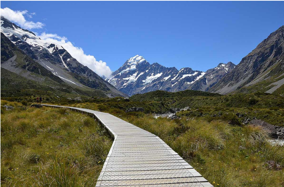
Aoraki Mount Cook National Park