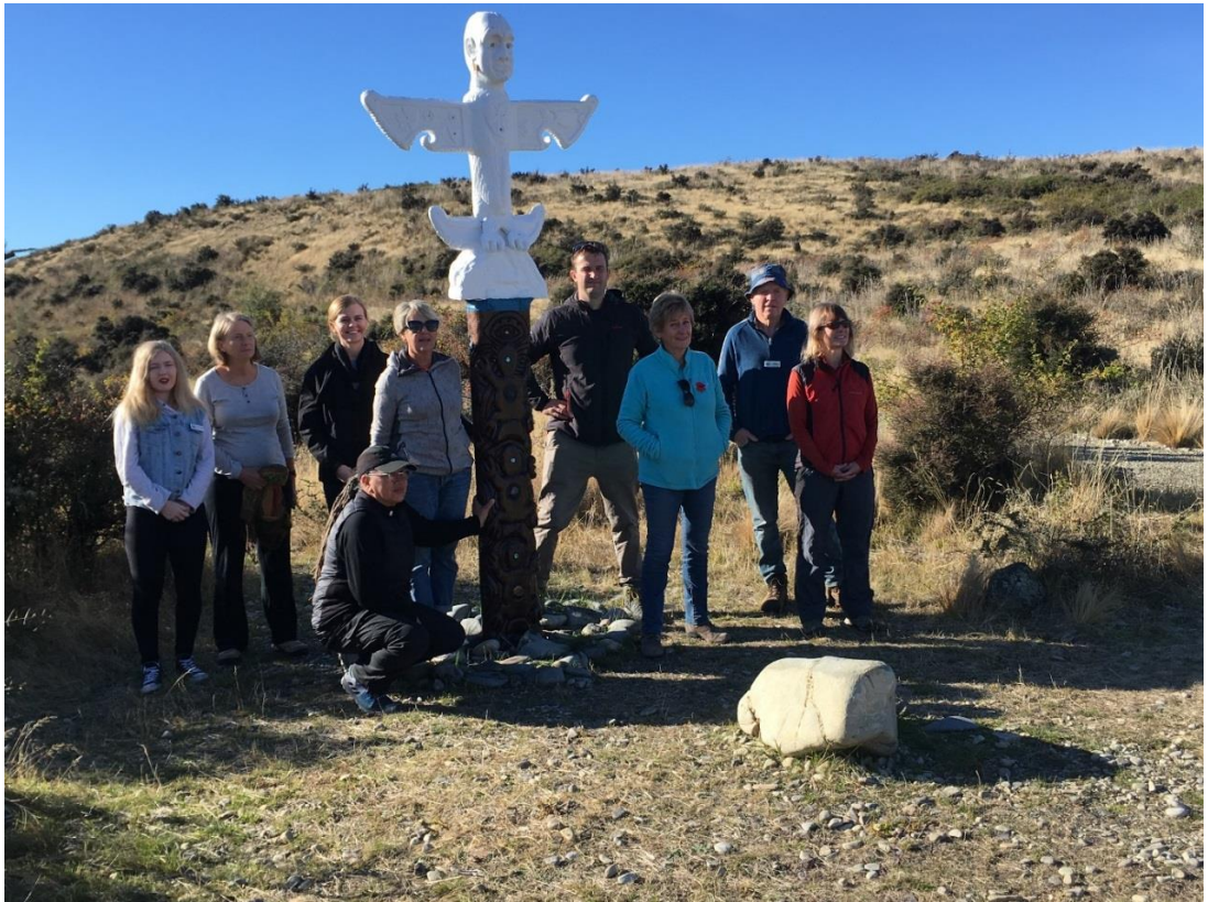
Pou dedicated to Te Maihora, Lake Ohau