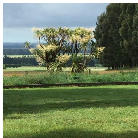
Wooded Gully, Mount Thomas Conservation Area