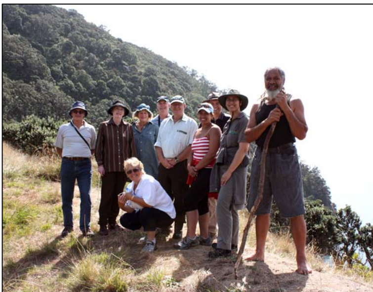
The Board, DOC staff and Te Tapatoru a Toi members on Moutohora (Whale Island), Whakatane (March 2010)

The Board's draft Bay of Plenty Conservation Management Strategy (CMS) was taken off the table after the Conservancy amalgamation meant that both of the draft CMS's would need to be merged. The Conservation Board continues to cite the valuable work that is being done by Community Landcare Groups, Iwi, passionate individuals and Conservancy Staff throughout the East Coast Bay of Plenty Conservancy. I would like to take my hat off to the Conservancy Staff that successfully managed the Whirinaki 25 celebrations. It was also the first time I met our now new Minister of Conservation, Hon Kate Wilkinson.