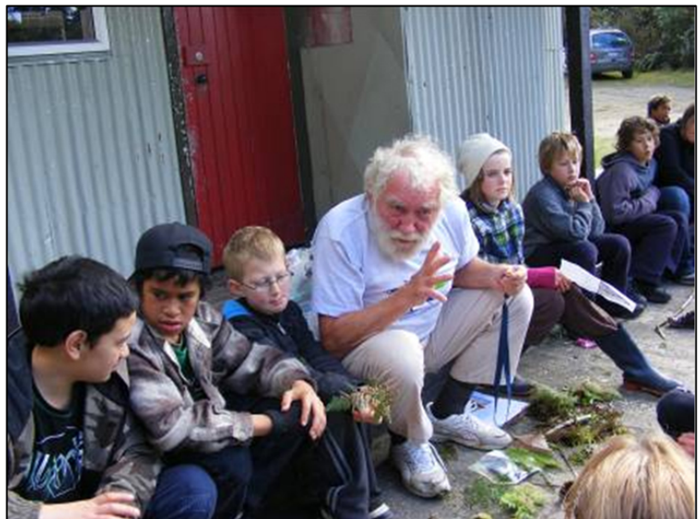
Dr David Bellamy with school children at the Whirinaki 25 Celebrations (September 2009)