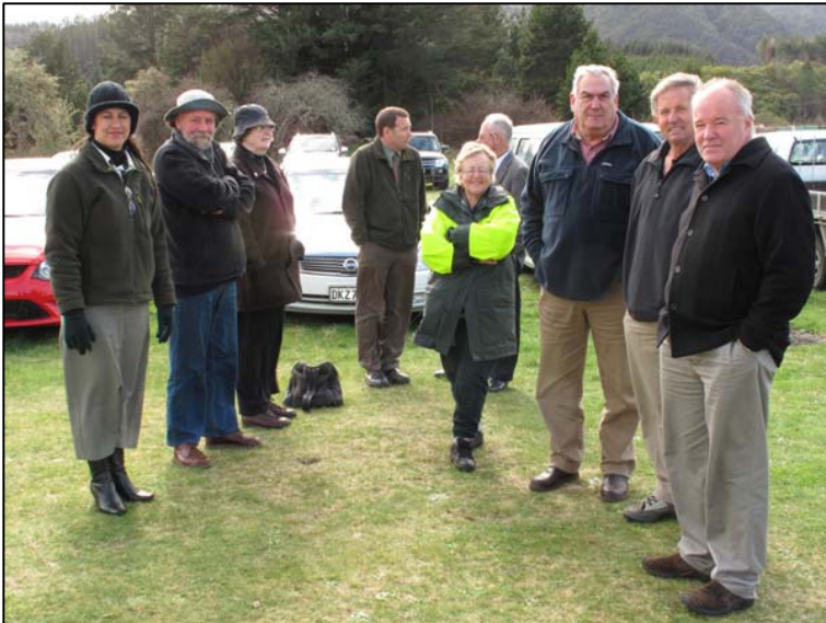
The Conservation Board and DOC staff awaiting the powhiri welcome on to Murumurunga Marae at Te Whaiti for the Whirinaki 25 th Anniversary Celebrations (September 2009)

The Board was clear that it did not want to be involved in further work on the CMS until this matter has been agreed between the NZCA and Department and that there was a clear path to approval.