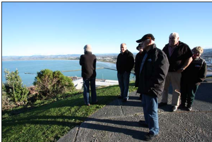
The Board and DOC staff and on Kaiti Hill overlooking Gisborne (June 2010)