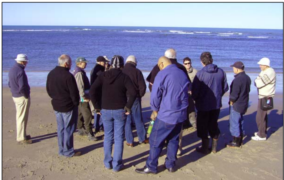
The Board and DOC staff at Te Tapuwae O Rongokako Marine Reserve, Whangara (June 2010)

The Minister asked that the East Coast Bay of Plenty Conservation Board establish Te Tapuwae O Rongokako Marine Reserve Committee as a committee of the Board using its powers under section 6N of the Conservation Act. The Board would also need to appoint a Board representative on the committee.