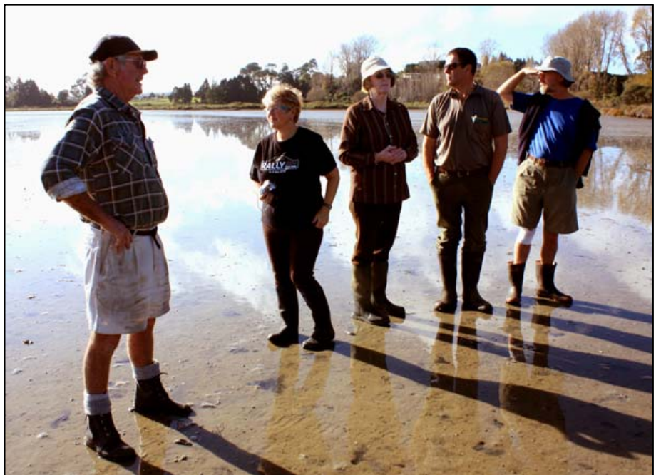
The Board and DOC staff visiting Waikaraka Estuary in Tauranga (May 2010)