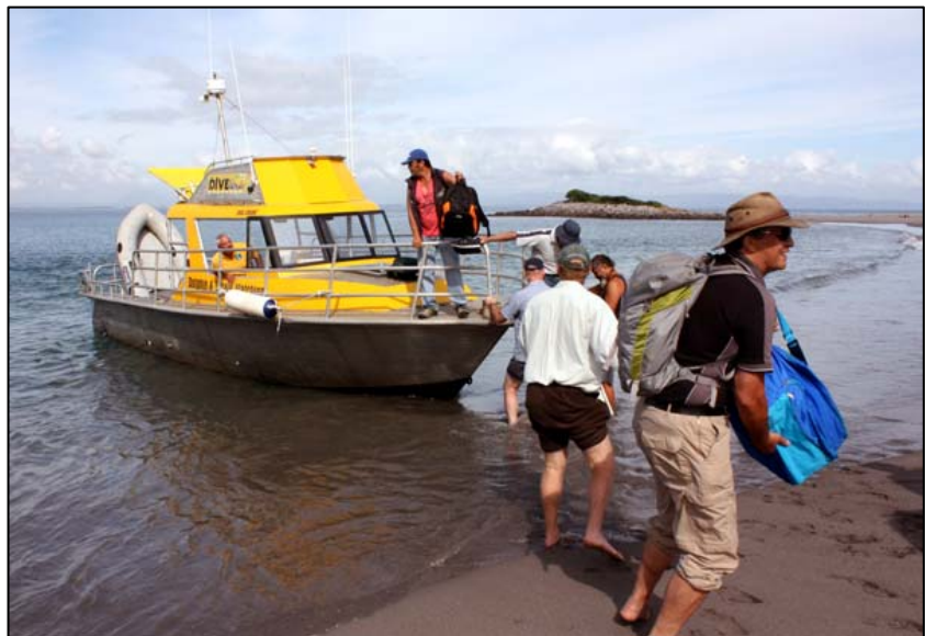
The Board and DOC staff arriving at Moutohora/Whale Island near Whakatane (March 2010)

The outcomes, objectives and management policies of CMS Section 2.4 include both direct island management and a wide range of complex and changing social values. This report addresses the biodiversity management and also reflects a reasonable snap-shot of the relationships pertaining to island management.