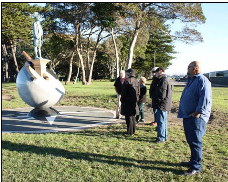
The Board and DOC staff visiting Captain James Cook's memorial statue in Gisborne (June 2010)

The Department is making progress toward meeting the Draft Strategy's milestones.