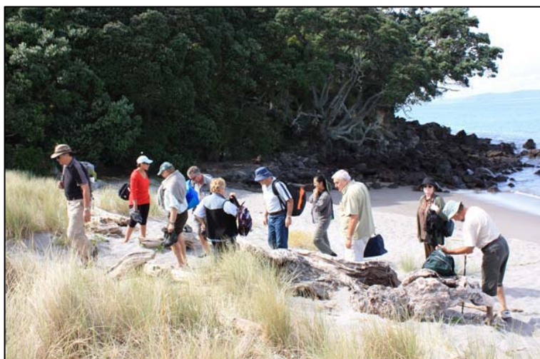
The Board and DOC staff arriving on to Moutohora (Whale Island), ready to be welcomed by Te Tapatoru a Toi (March 2010)