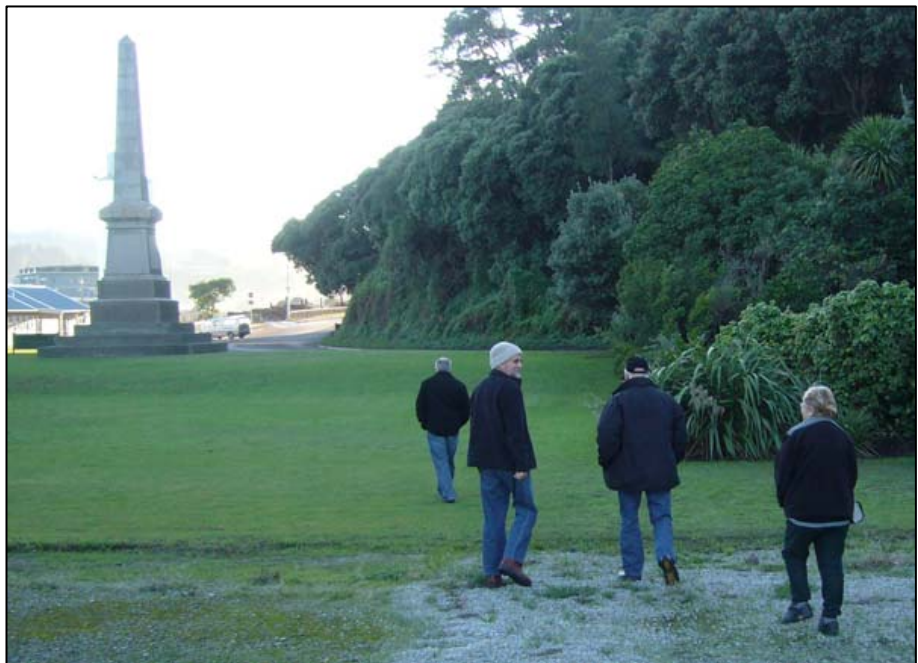
The Board and DOC staff visiting the Cook Landing Site National Historic Reserve in Gisborne (June 2010)