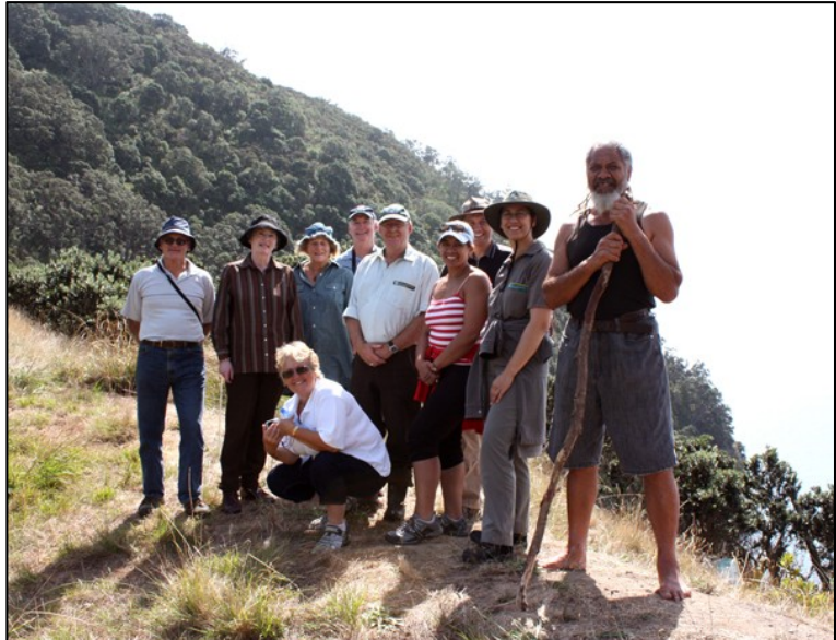
The Board, DOC staff and Te Tapatoru a Toi members on Moutohora (Whale Island), Whakatane (March 2010)

The Board's draft Bay of Plenty Conservation Management Strategy (CMS) was taken off the table after the Conservancy amalgamation meant that both of the draft CMS's would need to be merged. The Conservation Board continues to cite the valuable work that is being done by Community Landcare Groups, Iwi, passionate individuals and Conservancy Staff throughout the East Coast Bay of Plenty Conservancy. I would like to take my hat off to the Conservancy Staff that successfully managed the Whirinaki 25 celebrations. It was also the first time I met our now new Minister of Conservation, Hon Kate Wilkinson.