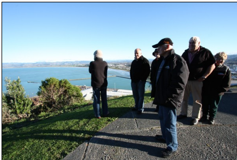
The Board and DOC staff and on Kaiti Hill overlooking Gisborne (June 2010)