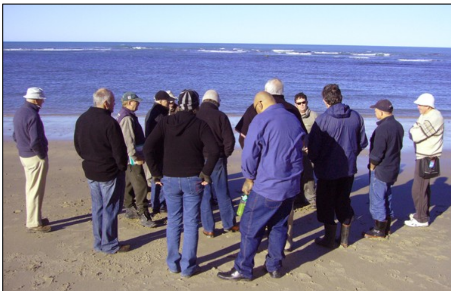
The Board and DOC staff at Te Tapuwae O Rongokako Marine Reserve, Whangara (June 2010)

The Minister asked that the East Coast Bay of Plenty Conservation Board establish Te Tapuwae O Rongokako Marine Reserve Committee as a committee of the Board using its powers under section 6N of the Conservation Act. The Board would also need to appoint a Board representative on the committee.