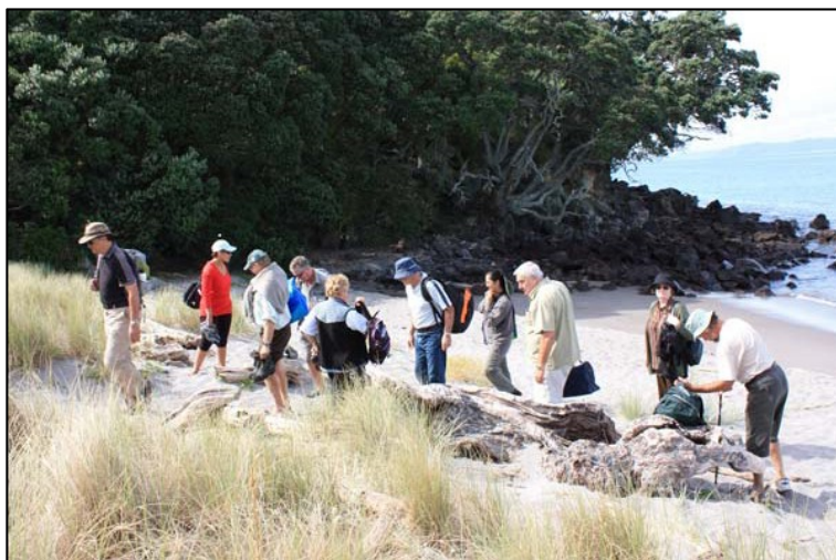
The Board and DOC staff arriving on to Moutohora (Whale Island), ready to be welcomed by Te Tapatoru a Toi (March 2010)