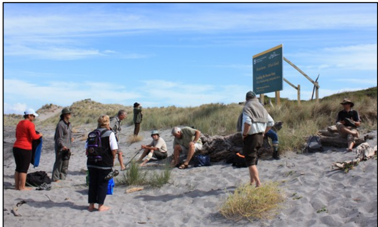
The Board, DOC staff and members of Te Tapatoru a Toi on Moutohora/Whale Island (March 2010)