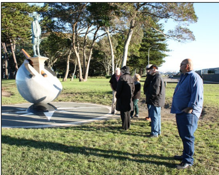
The Board and DOC staff visiting Captain James Cook's memorial statue in Gisborne (June 2010)

The Department is making progress toward meeting the Draft Strategy's milestones.