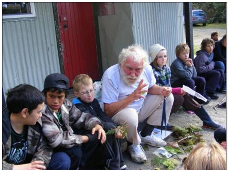
Dr David Bellamy with school children at the Whirinaki 25 Celebrations (September 2009)