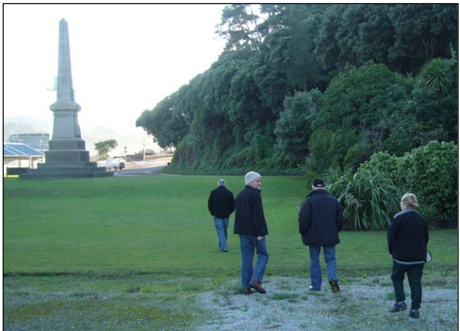
The Board and DOC staff visiting the Cook Landing Site National Historic Reserve in Gisborne (June 2010)