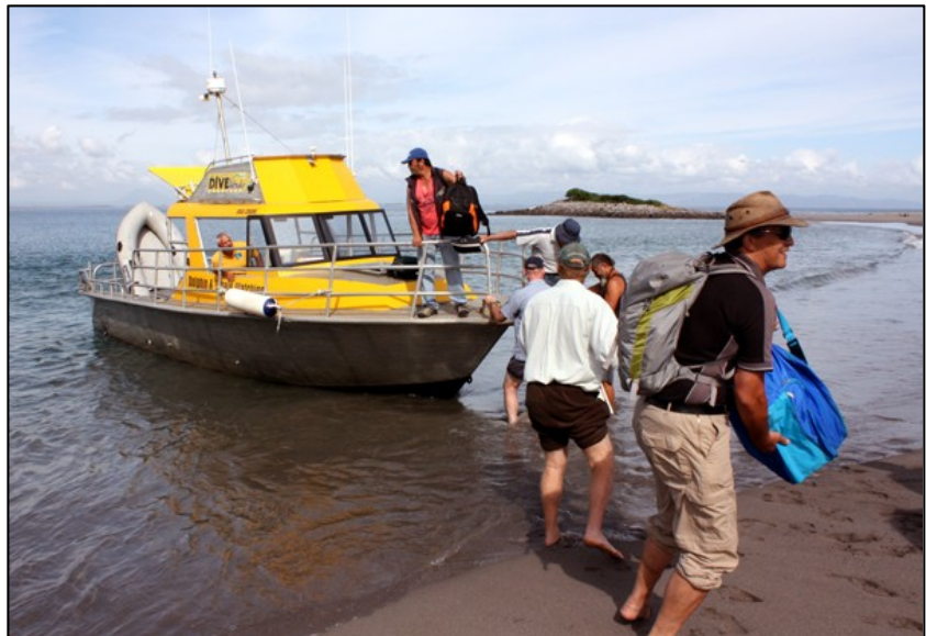
The Board and DOC staff arriving at Moutohora/Whale Island near Whakatane (March 2010)

The outcomes, objectives and management policies of CMS Section 2.4 include both direct island management and a wide range of complex and changing social values. This report addresses the biodiversity management and also reflects a reasonable snap-shot of the relationships pertaining to island management.