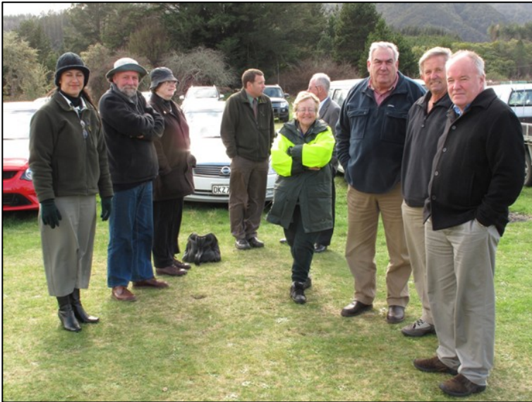
The Conservation Board and DOC staff awaiting the powhiri welcome on to Murumurunga Marae at Te Whaiti for the Whirinaki 25 th Anniversary Celebrations (September 2009)

The Board was clear that it did not want to be involved in further work on the CMS until this matter has been agreed between the NZCA and Department and that there was a clear path to approval.