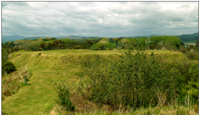
Board members visited Tauwhare Pa Scenic Reserve in October 2008. The fortified pa site is clearly visible in the photograph above.