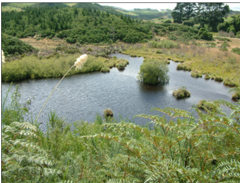
Kapenga wetland near Rotorua