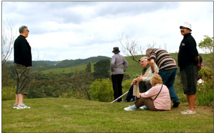
The Board and DOC staff on a field trip to Tauwhare Pa Scenic Reserve near Whakatane (October 2008)

The presentation was initially well received by the Authority. The feedback from the Authority at that meeting was that they were very conscious this is the first of the second generation CMSs developed under the Conservation General Policy 2005 and in the new format that the Department recommended. From that perspective, the Authority was mindful that this process would take some additional effort on their part and that they are aware of the standard that would be set.