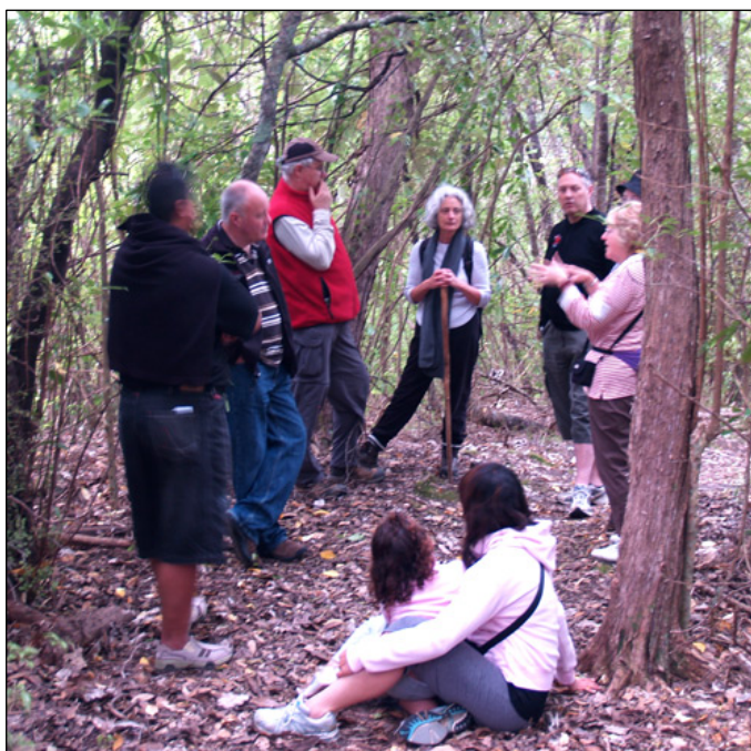
Board members, DOC staff and family members on a field trip to Ohope Scenic Reserve, near Whakatane (October 2008)