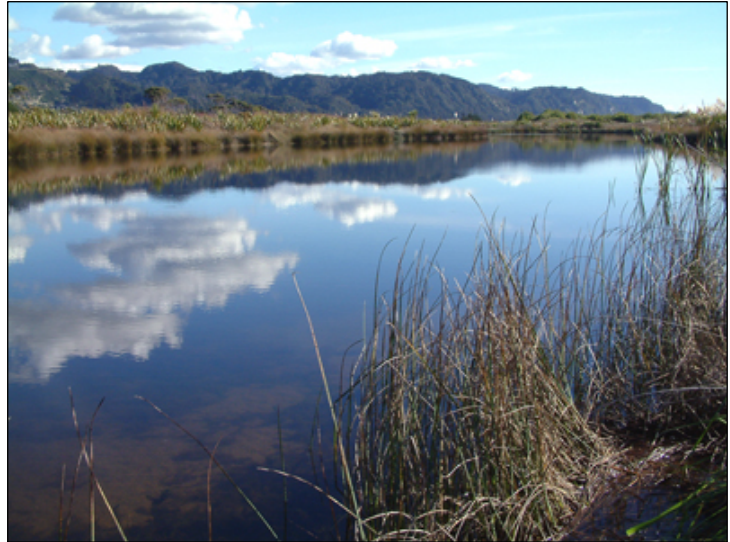
Matata Lagoon at Matata in the Eastern Bay of Plenty

The Board's Conservation Management Strategy (CMS) field visits provide the Board with an invaluable insight into the great work that is being done by community groups and conservancy staff throughout the Bay of Plenty Conservancy. These visits are also an important part of our "handshake" with communities such as Community Landcare Groups, Iwi and passionate individuals who assist the Board in identifying conservation issues. Our role as community conservation representatives is enhanced by the knowledge we gain during the CMS monitoring regime we undertake throughout the year.