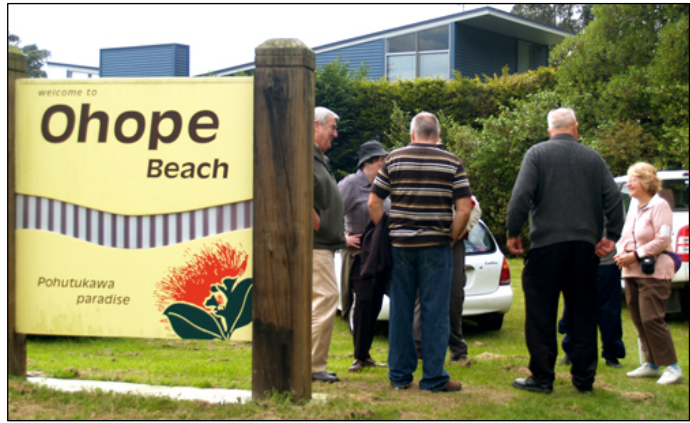
The Board, DOC staff and family members on a field trip to Ohope Scenic Reserve, near Whakatane (October 2008)