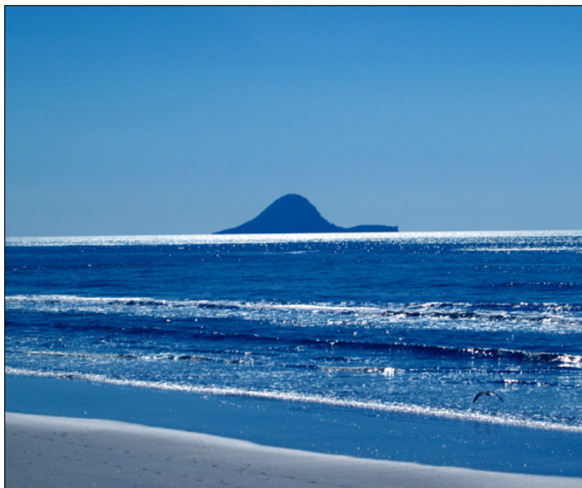
A view of Moutohora (Whale Island) from Ohope Beach, near Whakatane