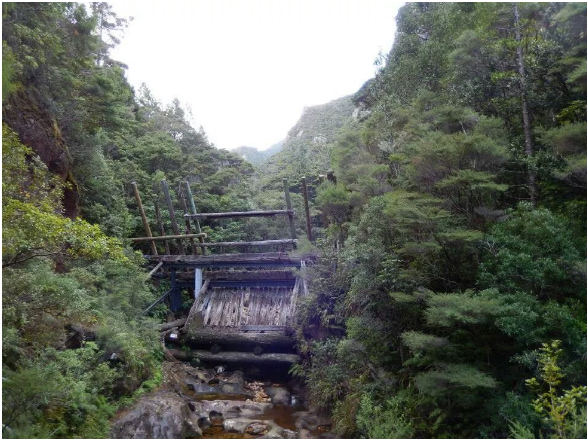
The Kaiaraara Dam prior to the severe storm event 10 June 2014

Te Motu Aotea / Great Barrier Island contains the largest area of indigenous forest in New Zealand that remains possum free. Seven bridges were completed between Forest Rd and the Upper Kauri Dam on the Kaiaraara Track, with work to upgrade of the Hot Springs, Tramline, Peach Tree and South Fork Track sections of the Aotea Track, which involved approximately 300 tons of materials flown to site. The Mt Heale Hut on Aotea / Great Barrier Island has been popular with trampers, in conjunction with “The Aotea Track” which was a combination of several existing tracks linking the two huts (Kaiaraara and Mt Heale), with options of including two campsites.